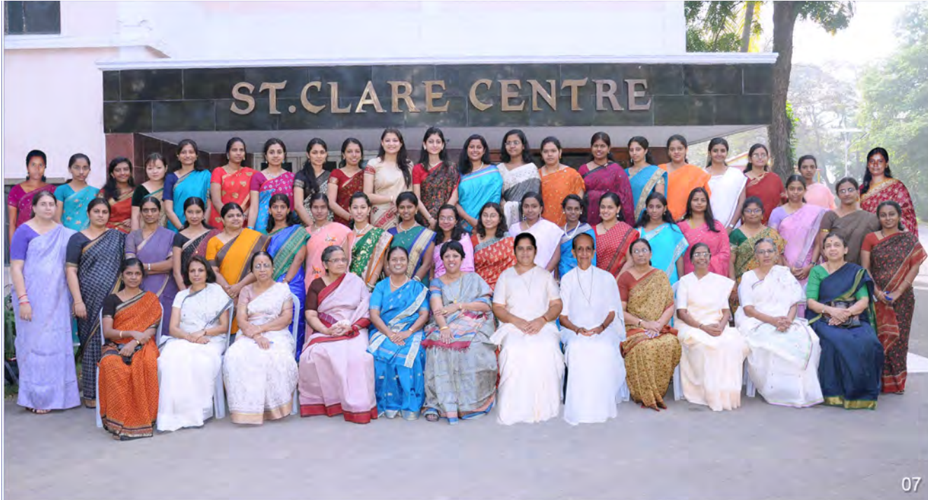
II M.A. English