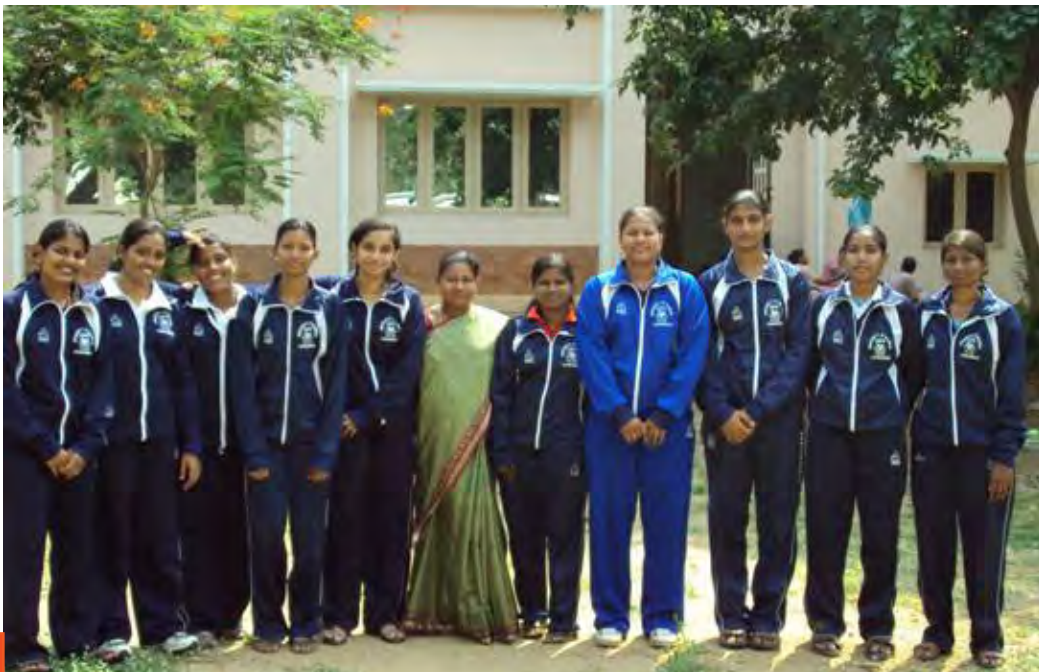
University Players 2009 - 2010