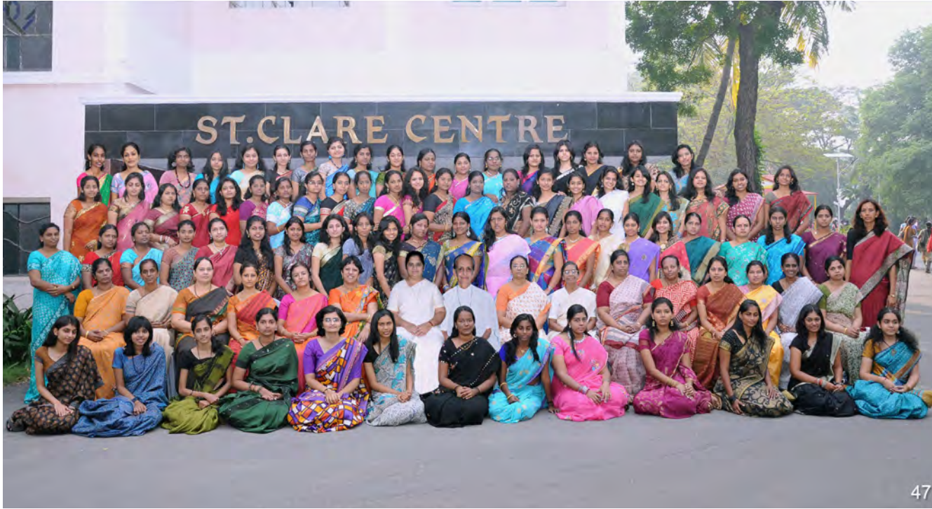
III B.Com. (A2)