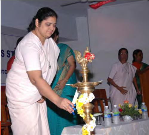
Inauguration of the Women's Studies Cell by the Principal

time, whose compassion towards women in need, more than a century ago, guided her mission to empower them through education, rehabilitation and entrepreneurial skills.