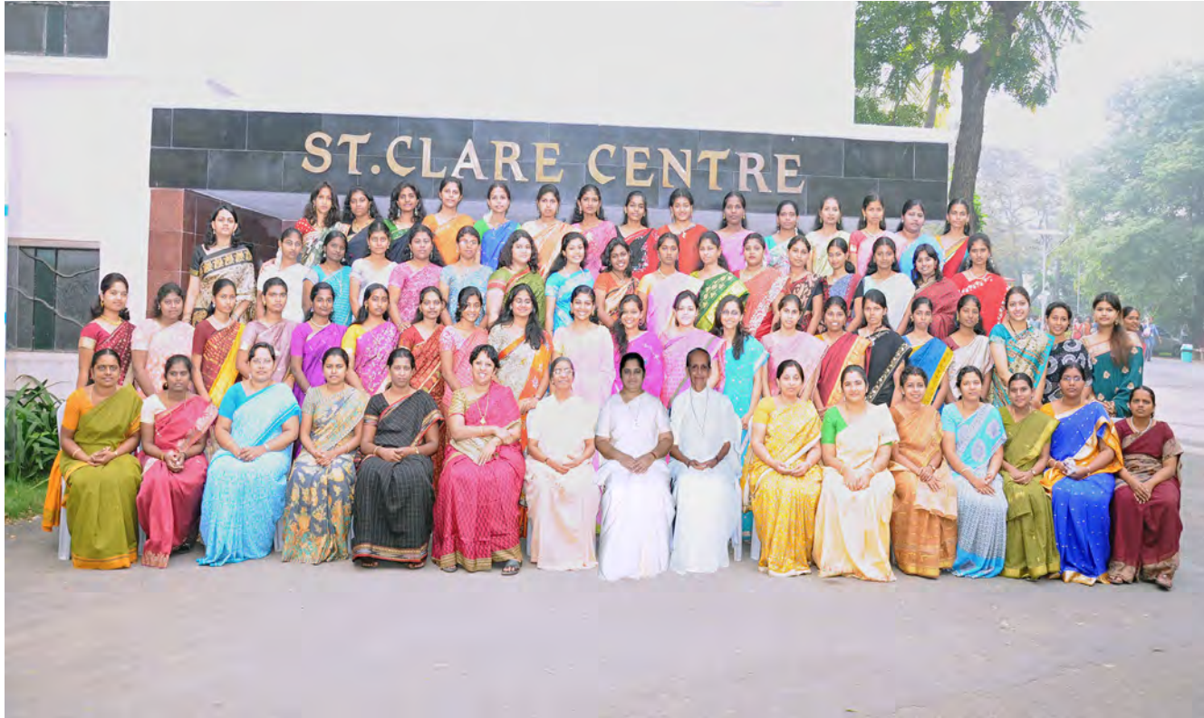
III B.C.A. (Sec B)