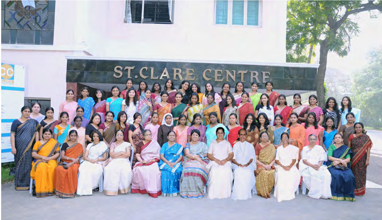
III B.A. English