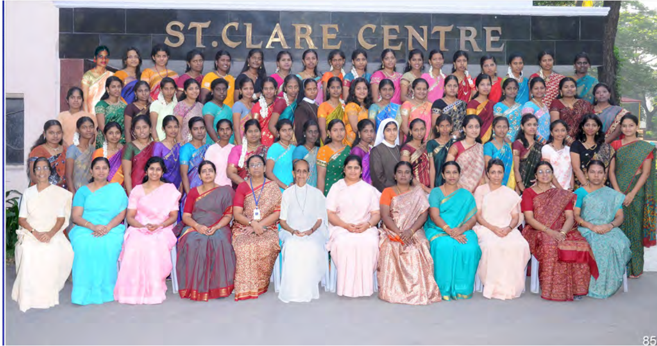
III B.Sc. Mathematics (Day)