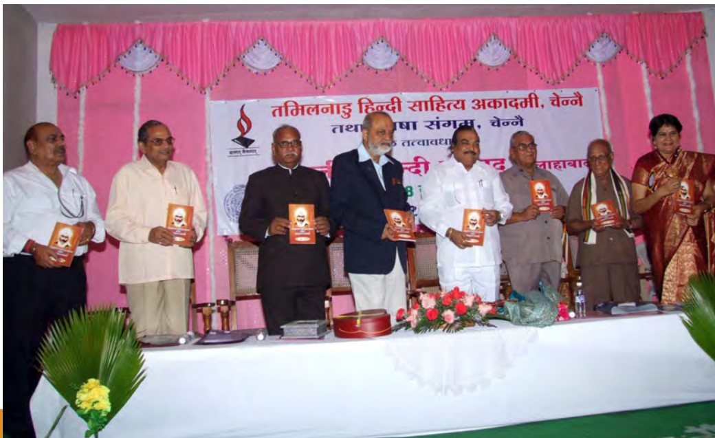
At the National Conference on 'Linkages Between Hindi and Other Indian Languages'