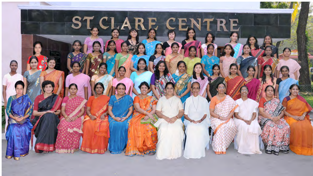
III B.Sc. Plant Biology and Plant Biotechnology