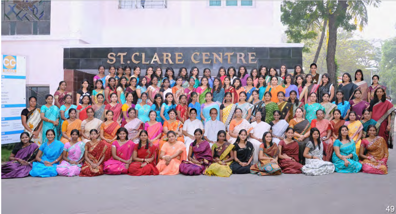
III B.Com. (A3)