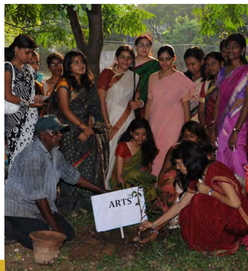
At the tree-planting ceremony