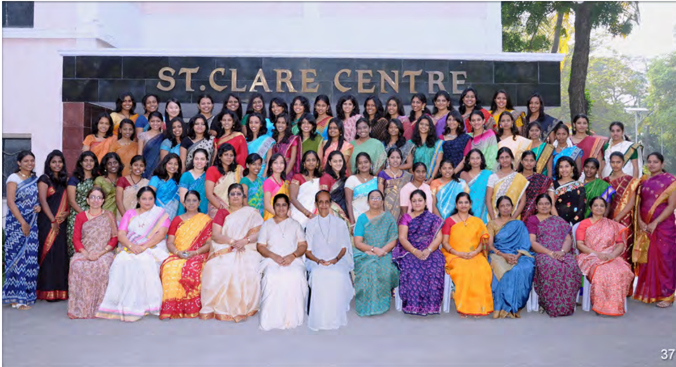
III B.A. Economics