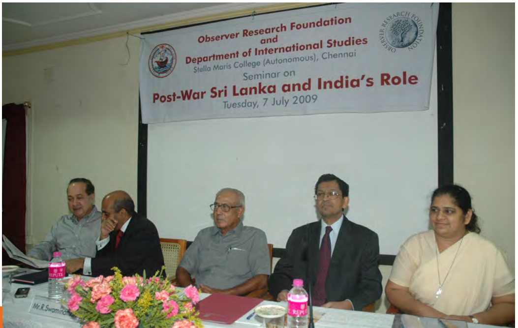
Seminar on Post War Sri Lanka