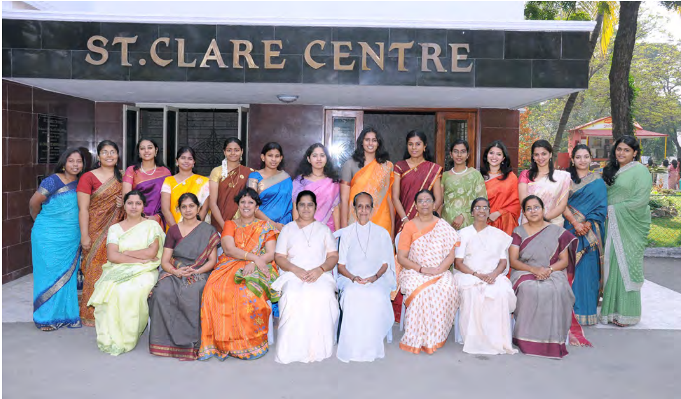
II M.A. International Studies