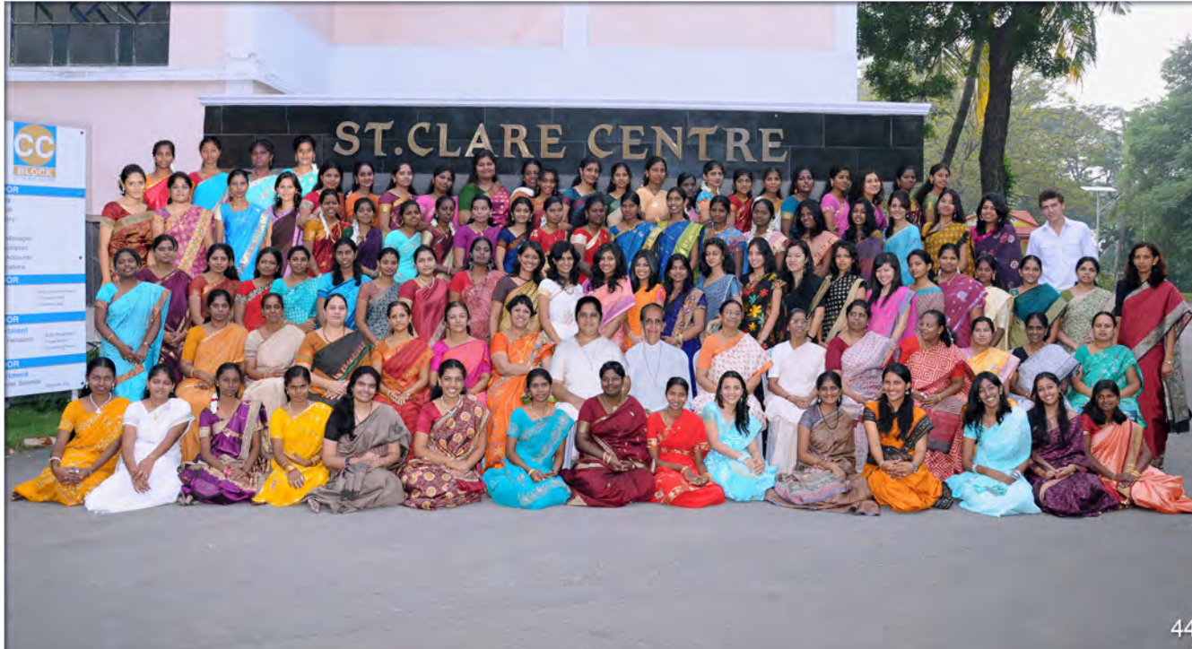
III B.Com (Day)