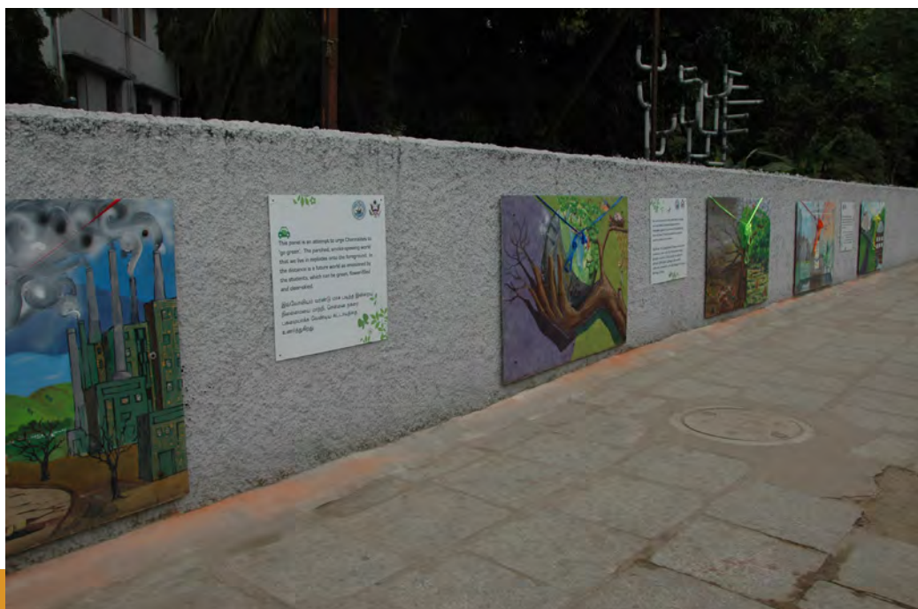
Multimedia mural on compound wall of Stella Maris College

in the category Exterior Painting of autos. World Vision, a Christian humanitarian organisation working for lasting change in the lives of underprivileged children, families and communities, decided to harness the artistic skills of the students of the Department of Fine Arts and the college of Fine Arts, Chennai, to illustrate quotations on the concept of peace titled 'The Peace Quote Campaign' in order to foreground its goal of 'Peace, A Right of Every Child'. Thirteen paintings were executed by the students of the Department of Fine Arts. The paintings were then displayed at Vinyasa Premier Art Gallery, Chennai in September 2009. A small format coffee table book with the compilation of the quotations and paintings was released on the occasion.