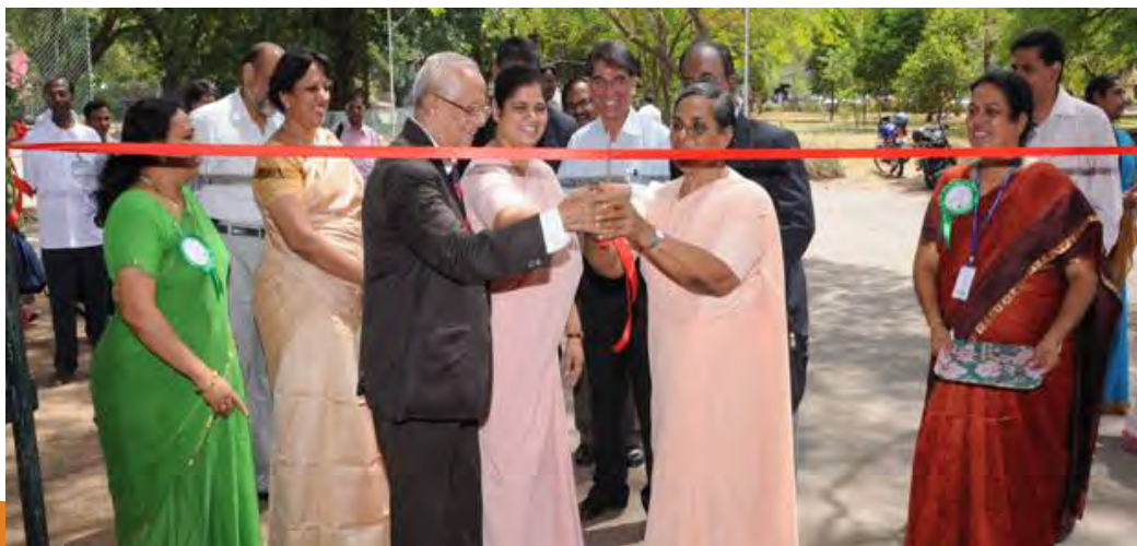
Inauguration of the exhibition on Algal Products