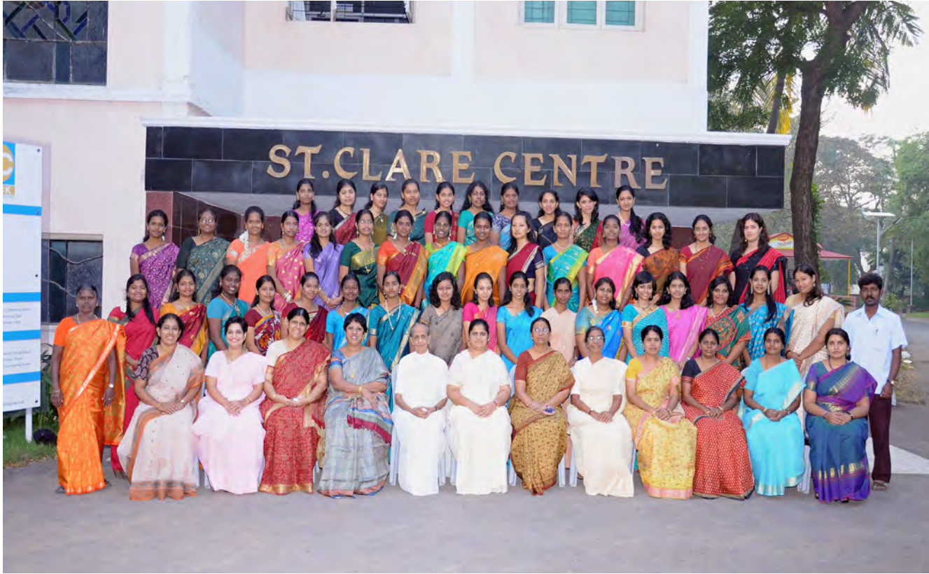
III B.Sc. Advanced Zoology and Biotechnology