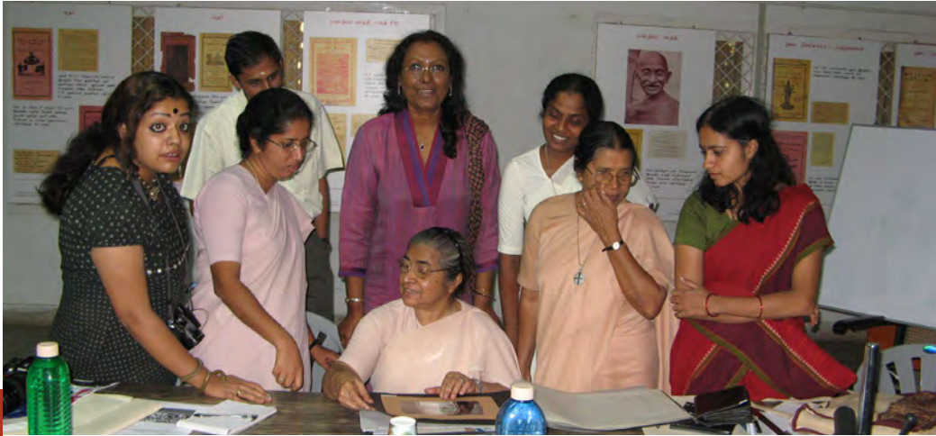
Participants at the National Workshop, Roja Muthiah Research Library