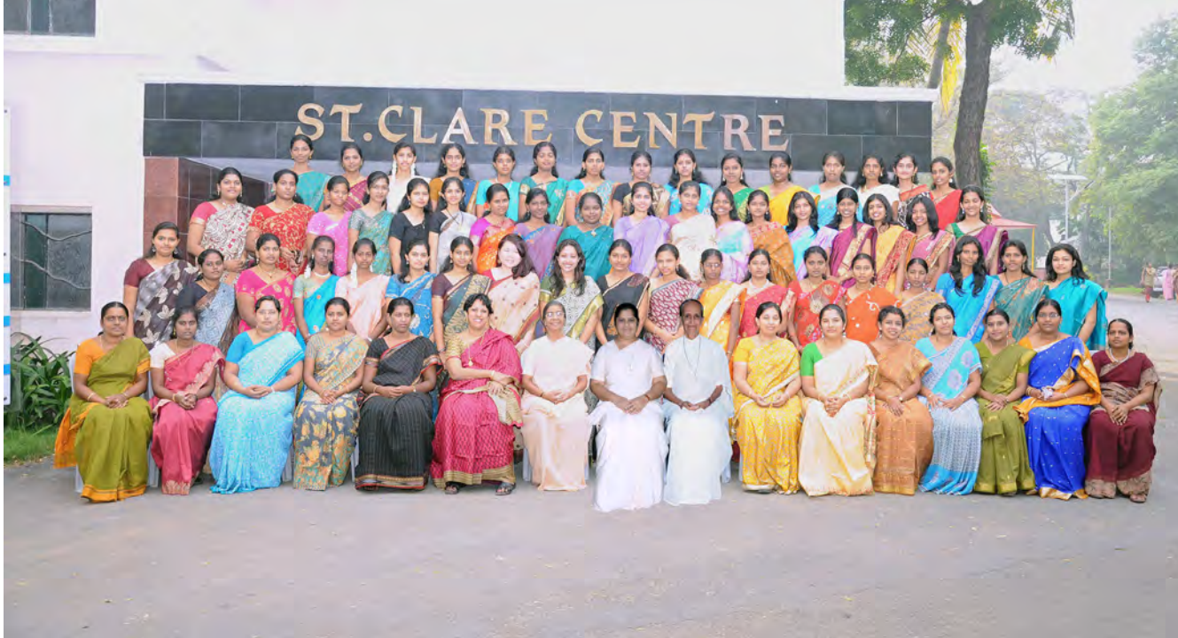
I III B.C.A. (Sec A)