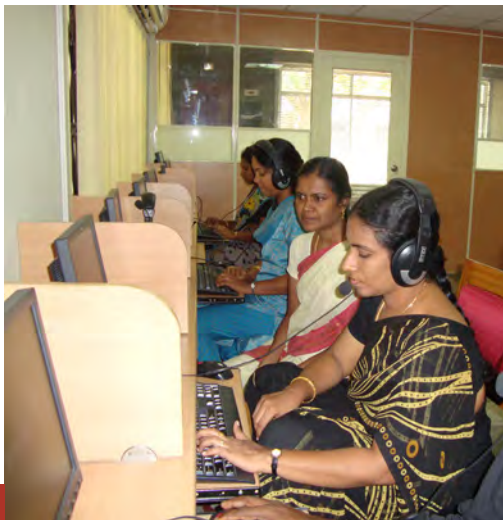
Administrative Staff at the Language Lab

training in Career Guidance and Training in Employability was offered to 30 final year undergraduates to help them explore and expand employment opportunities. The same group of students was given further training by professional trainers from the corporate sector, from 9-14 November 2009, in preparation for campus recruitment.