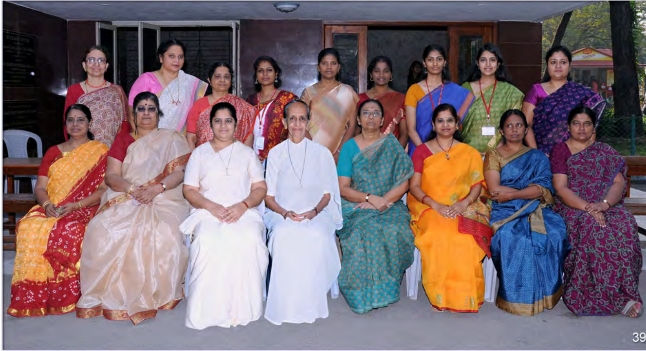
II M.A. Economics