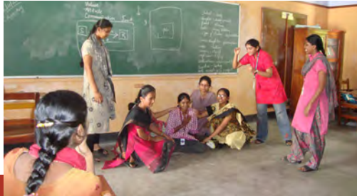
Students at the training programme

The Pathway Programmes for the year 2009-10 began during the summer vacation. A 30 hour training course in computer skills was conducted from 29 April to 2 May 2009, in which 80 first year undergraduate students participated. From 8-12 June 2009, skills