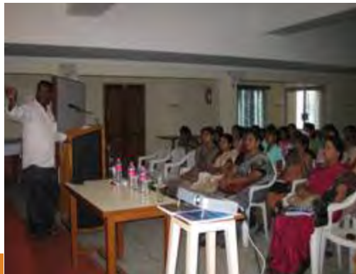
Workshop on Crystal Growth Studies