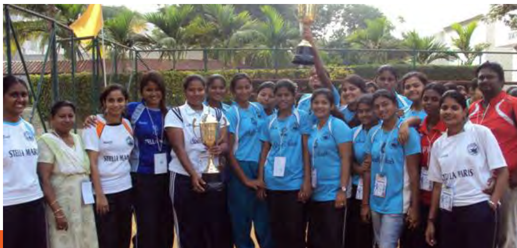
College Tennis Team with Winners Trophy won at Riviera 2010