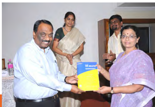
Regional Workshop for Young Researchers

The Department and the Institute of Development Research and Corporate Ethics organised a one-day workshop for young researchers on 'Globalisation and the Emerging World Order' on 18 September 2009.