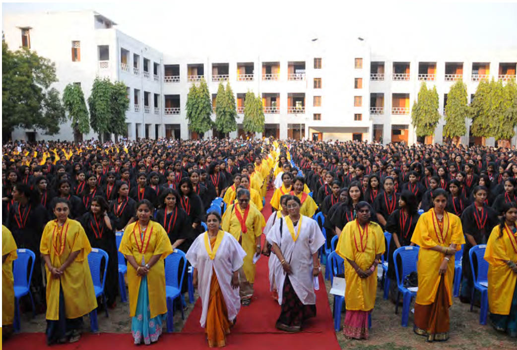
Faculty and graduates on graduation day