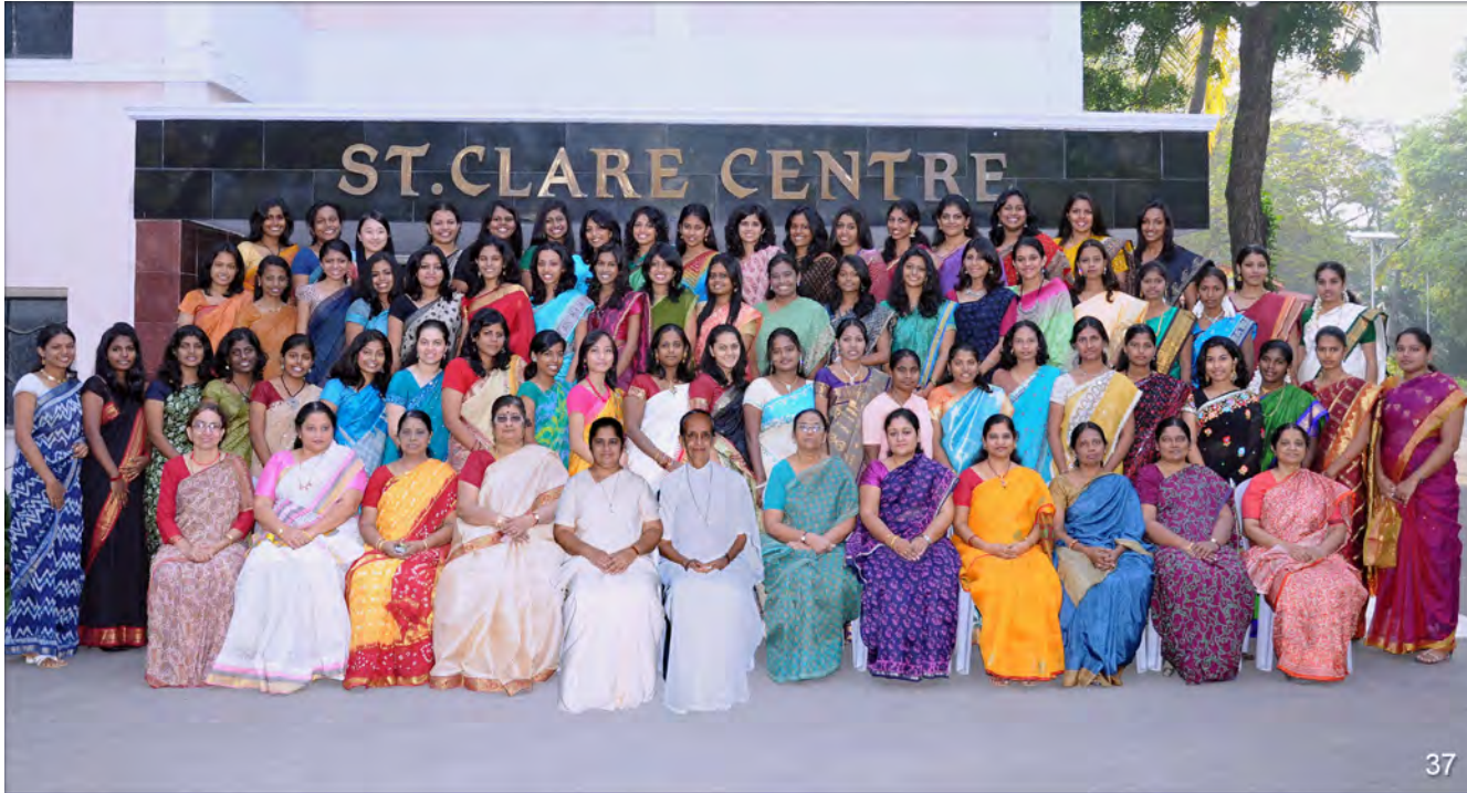
III B.A. Economics