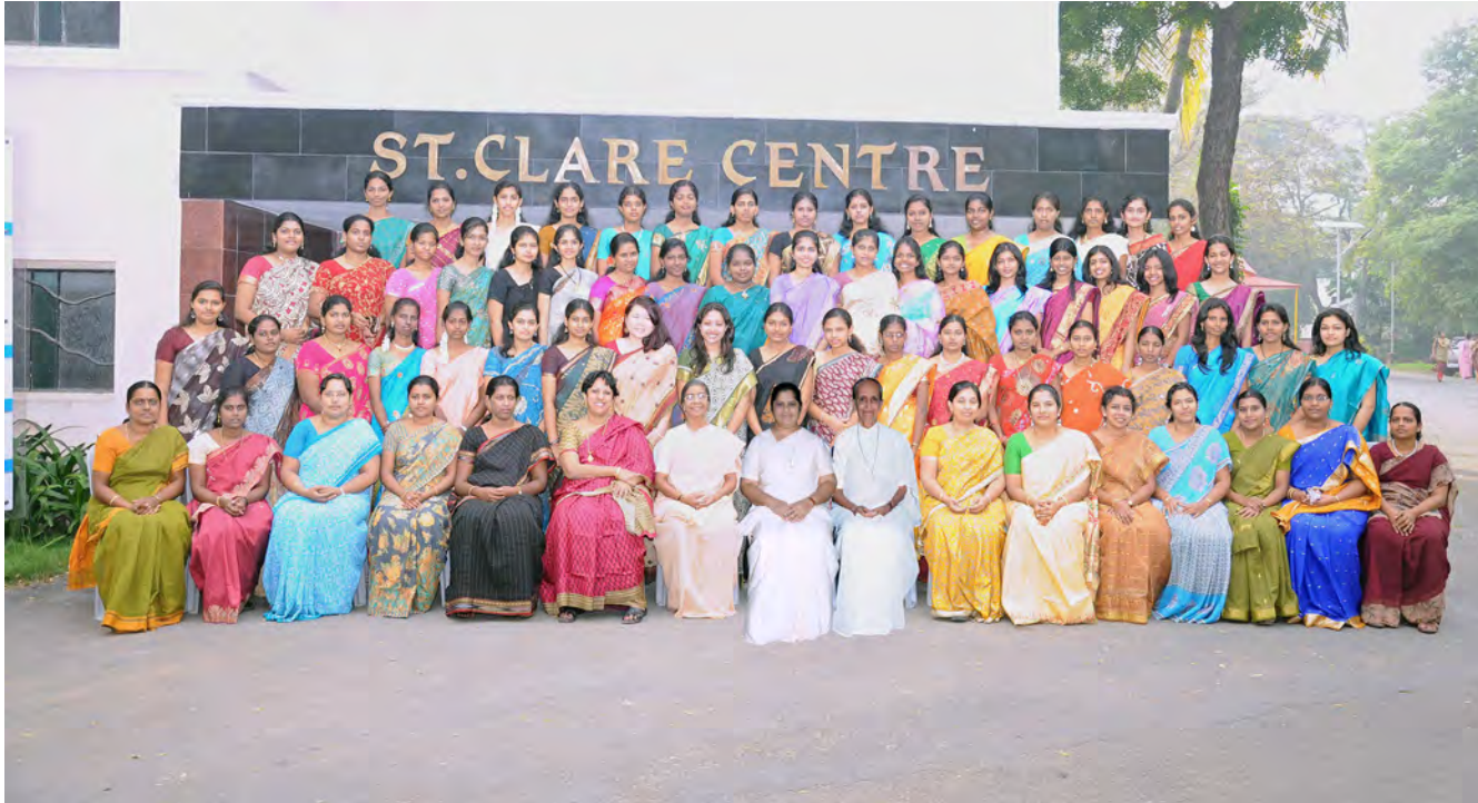
I III B.C.A. (Sec A)