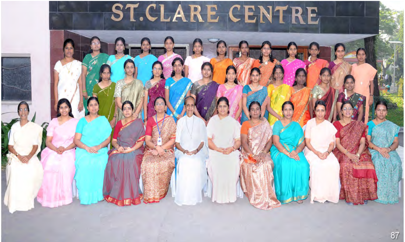
II M.Sc. Mathematics