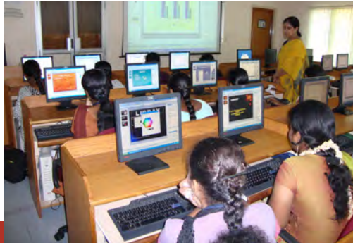
Summer Training in Basic Computer Skills