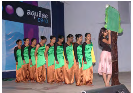
Aquilae , the annual inter-collegiate cultural event of Stella Maris College was hosted on 9 January 2010.