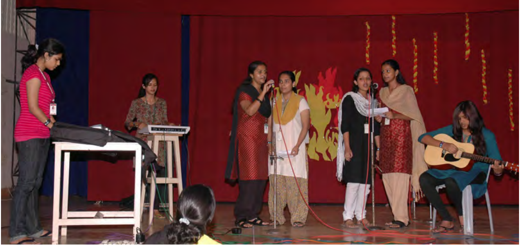
The Union has also conducted break-time presentations of clubs and organised events on special days like Ethnic Day, Friendship Day, Jatang Day, Onam, and Deepavali.