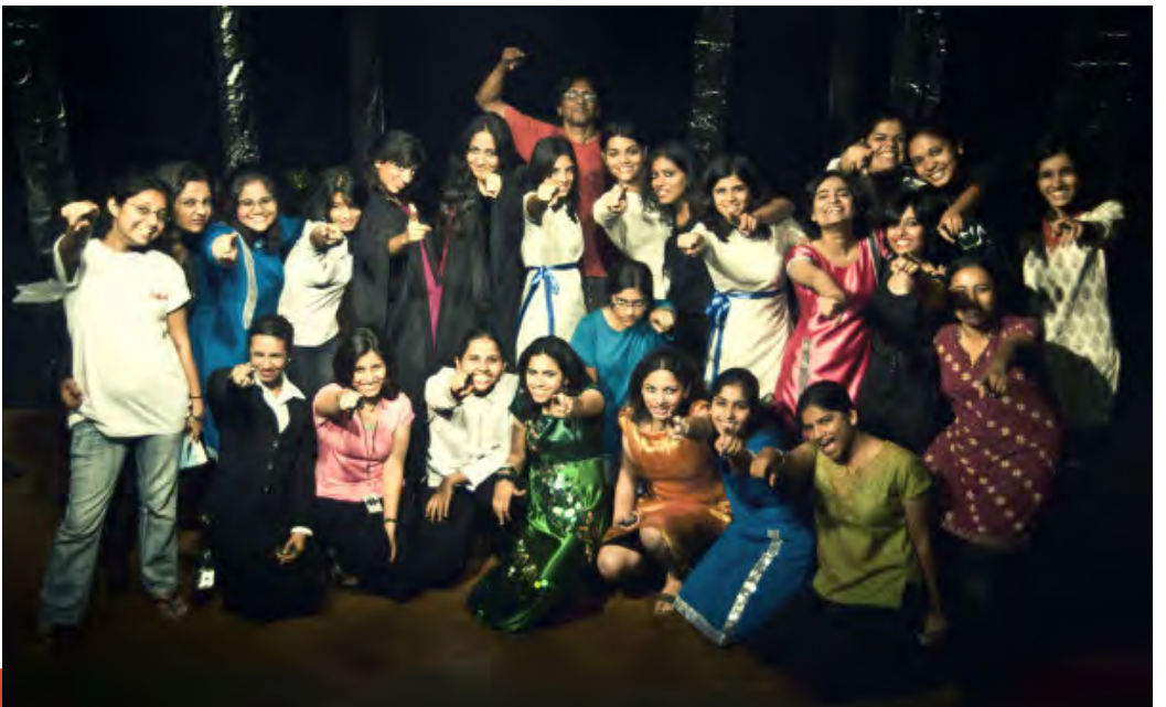
The annual student theatre production, 'Winding up the Charm'