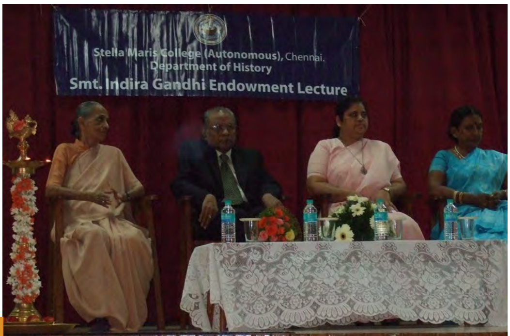
At the Smt Indira Gandhi Endowment lecture