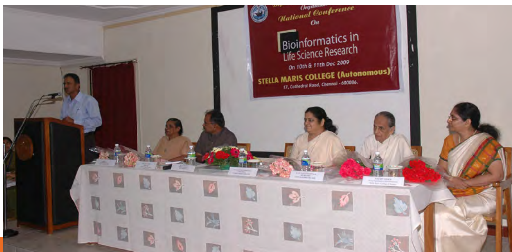
National-level conference on 'Bioinformatics in Life Science