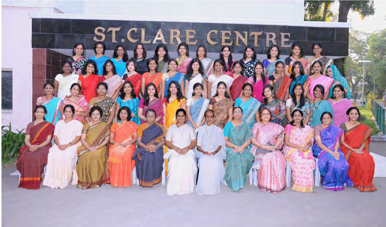
III B.A. Fine Arts