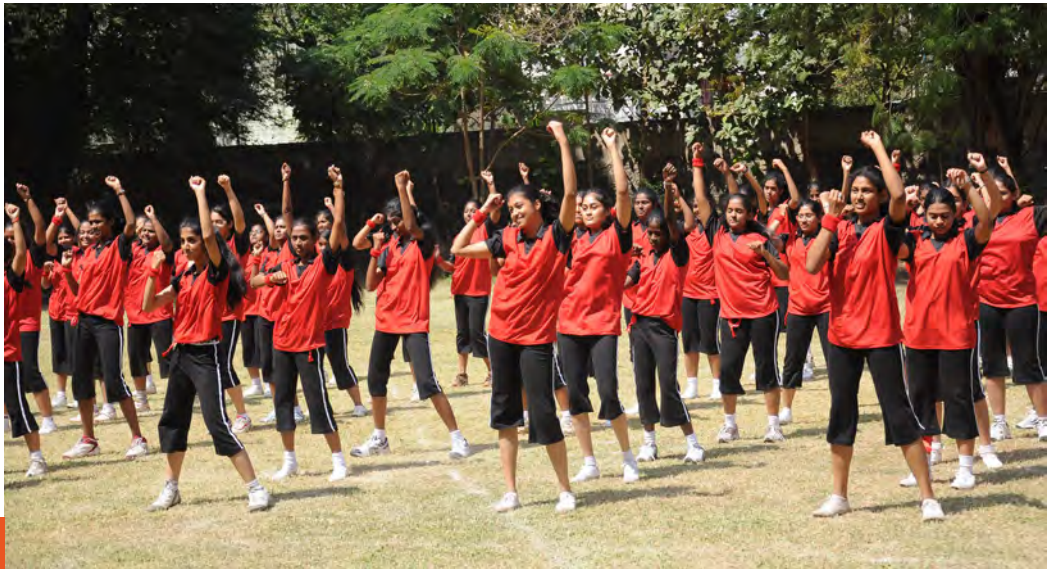
Aerobics on Sports Day