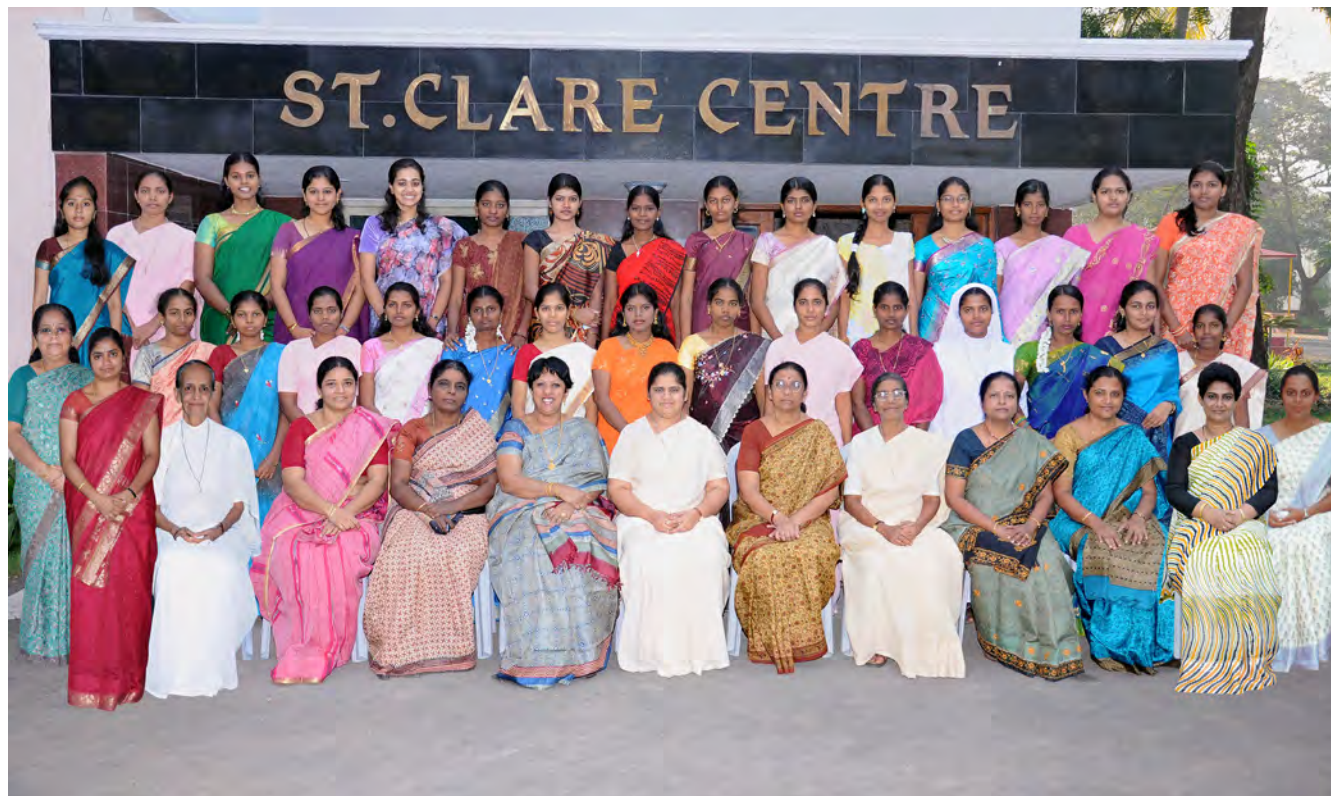
III B.Sc. Chemistry