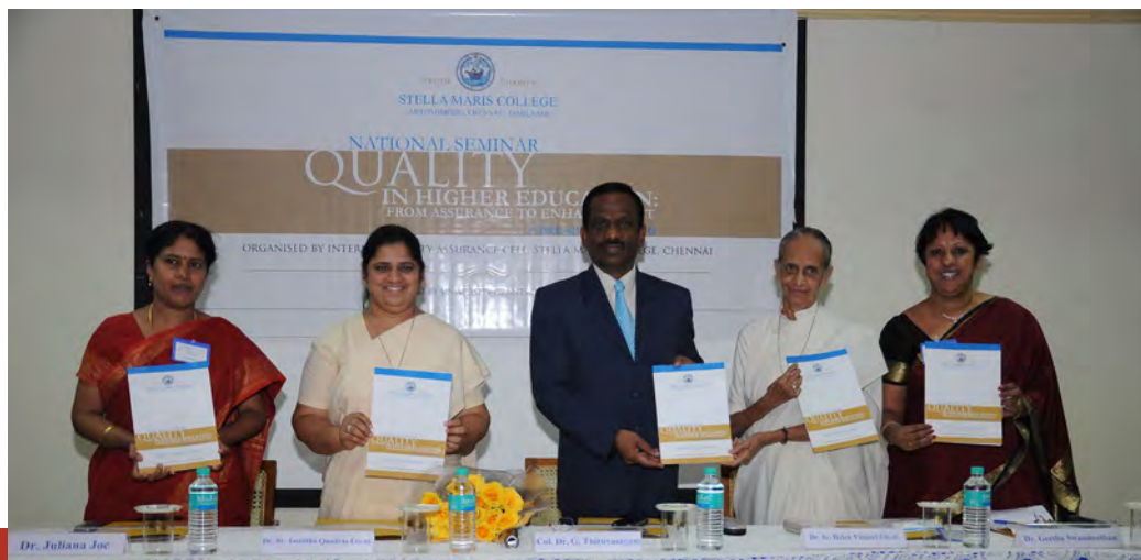
Release of the proceedings of the Seminar 'Quality in Higher Education: From Assurance to Enhancement'

Another very important initiative during the academic year 2009-10 was the launching of Mentoring for students. Every faculty member in the college has been assigned a set of students from the department, for whom periodic guidance and assistance are provided. To ensure the effective functioning of this Mentoring Programme the college has