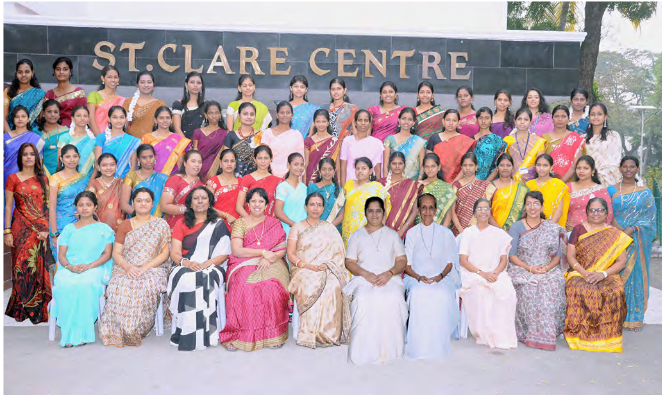
III B.A. History