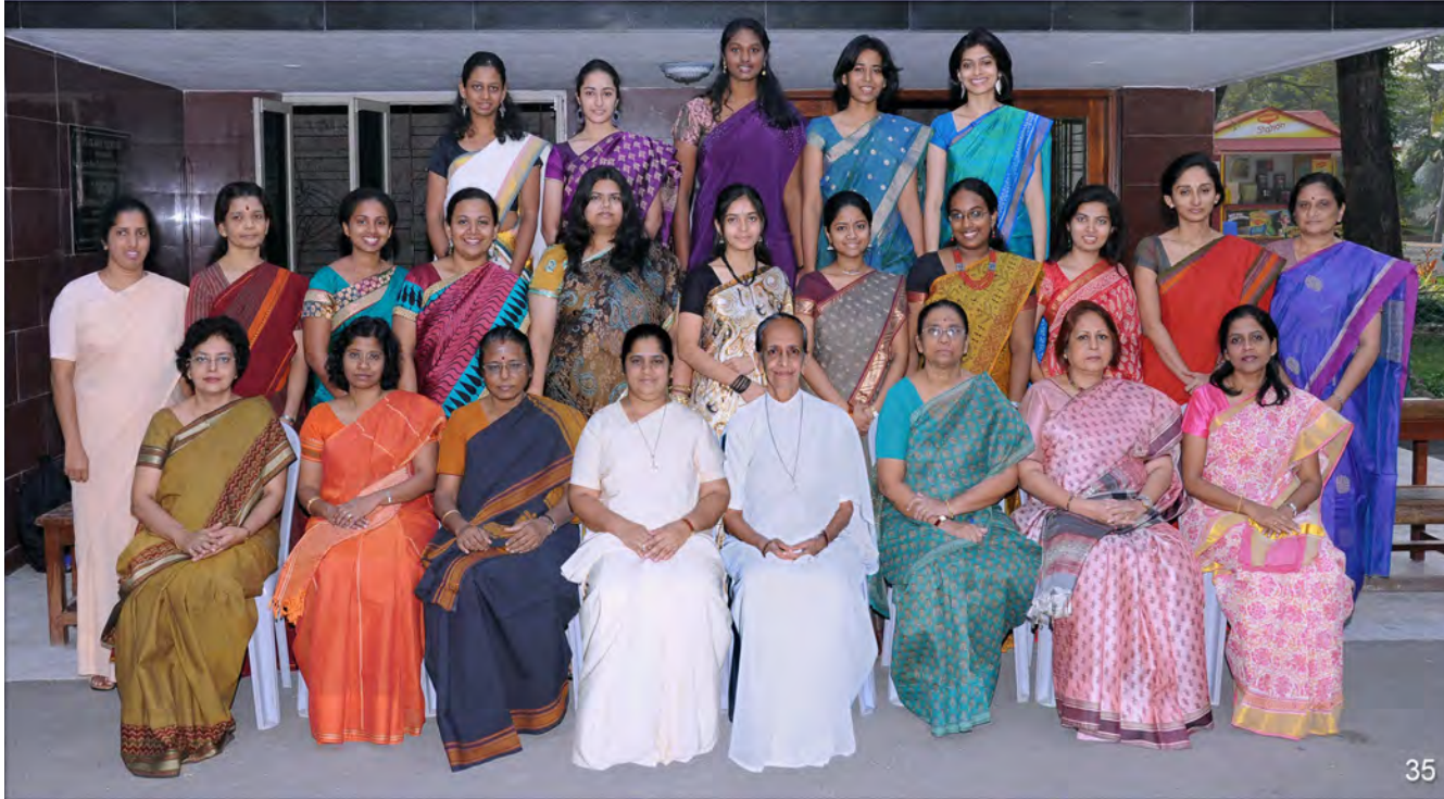
II M.A. History of Fine Arts