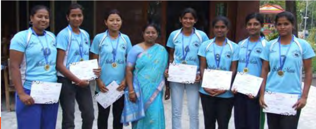
College Volleyball Team