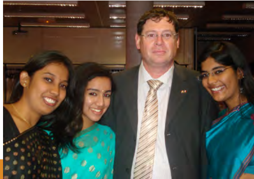
With the Coordinator of the IESEG program