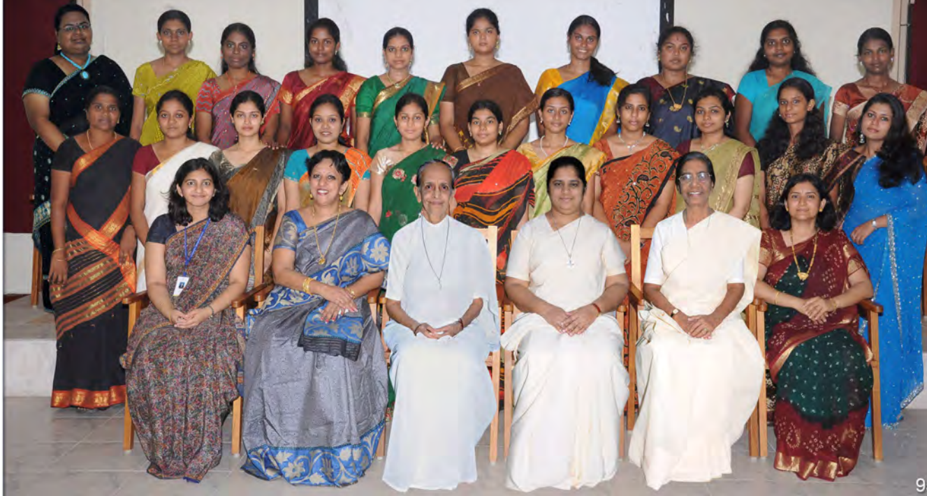
II M.Sc. Biotechnology