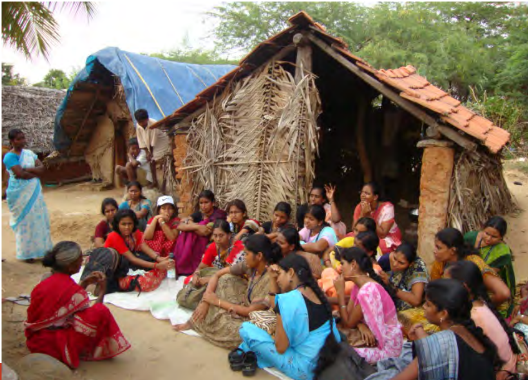
Students meeting women in the community

no direct access to roads and are cut off from civilisation during heavy rains. Sanitary conditions in the area are appalling - no toilets, open drains and effluents pollute the surroundings. The higher castes living in the vicinity pelt them with stones in an effort to get them to vacate this land. Enquiries by the police yielded no results and the stoning continued even in their presence. However, the community has resisted this continual mistreatment by asserting their rights and organising themselves to resist further oppression. Almost ten petitions were handed over to the District Superintendent of Police and the matter reported to the Commissioner of Police and the Women's