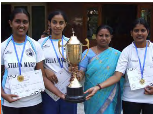
College Table Tennis Team Winners at Riviera 2010

At the national level inter-collegiate tournament (VESPO) conducted by MOP Vaishnav College on 29 and 30 July 2009, our college team won the first place.