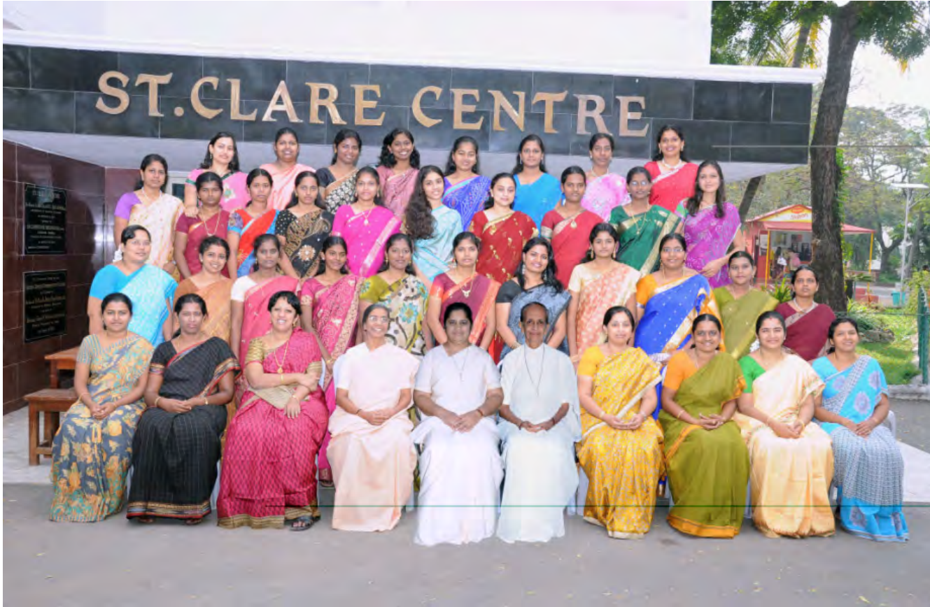
II M.Sc. (Information Technology)