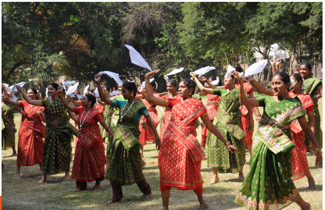
Folk Dance performance on Sports Day