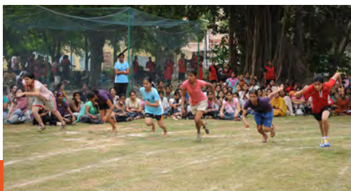
100 m. finals on College Sports Day

In Volleyball too our players were exceptional. At the State level Inter-collegiate Tournament conducted by DRBCC Hindu College from 14–16 December 2009,