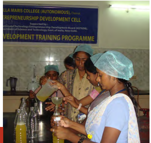
Student participants at the 'Skill Development Programme'

These training programmes have motivated many of the students to become entrepreneurs in a small way.