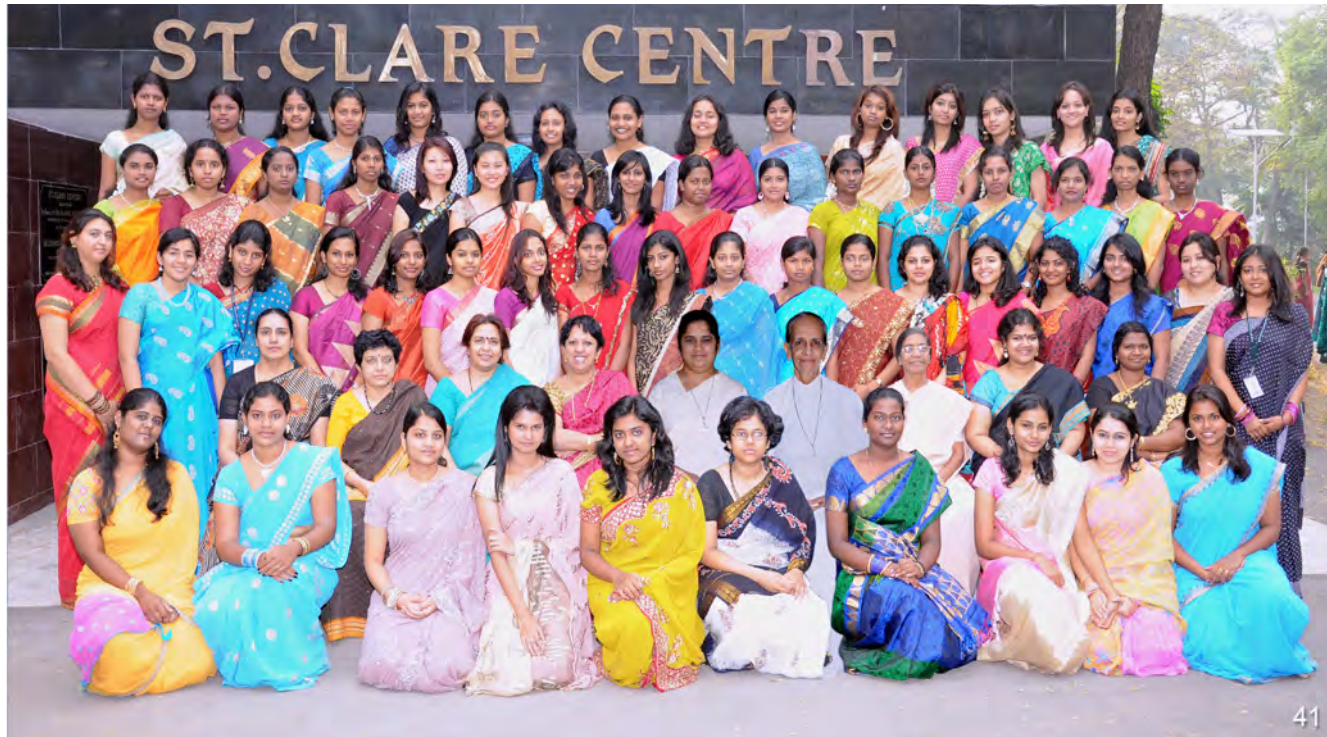
III B.A. Sociology