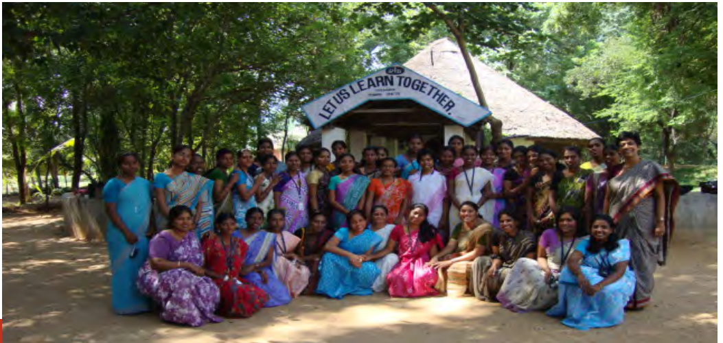
Social Work Rural Camp

Commission of the State. There was some respite after the then Collector ordered conducting of a Peace Committee meeting (which could however not be convened) and surveying of the land. However, the wait continued till 39 students and two faculty members of the Department of Social Work camped in these villages for a week. Time spent with the residents of Rajanagaram village was an opportunity