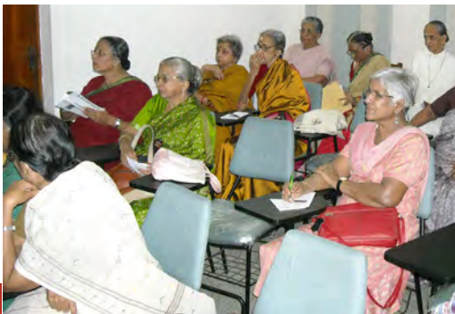
Meeting of retired faculty members