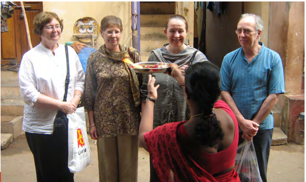
Faculty members of the Liverpool Hope University at Sangamam

Sangamam serves as a service-learning/ field-work agency for students of Stella Maris as well as students from various schools of Social Work in the city. The community-