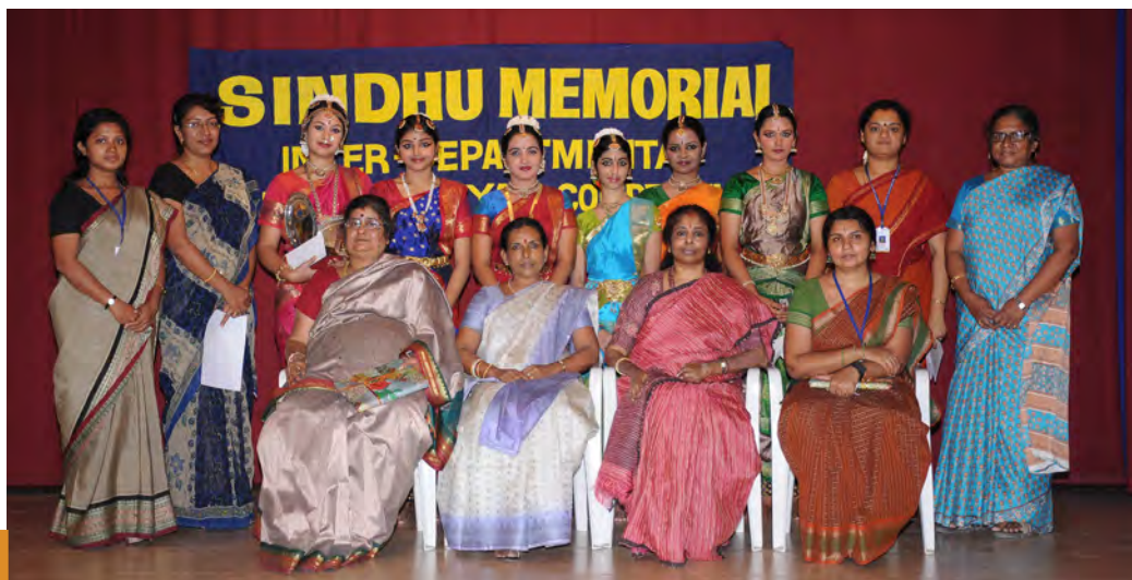
Participants with the judges and faculty