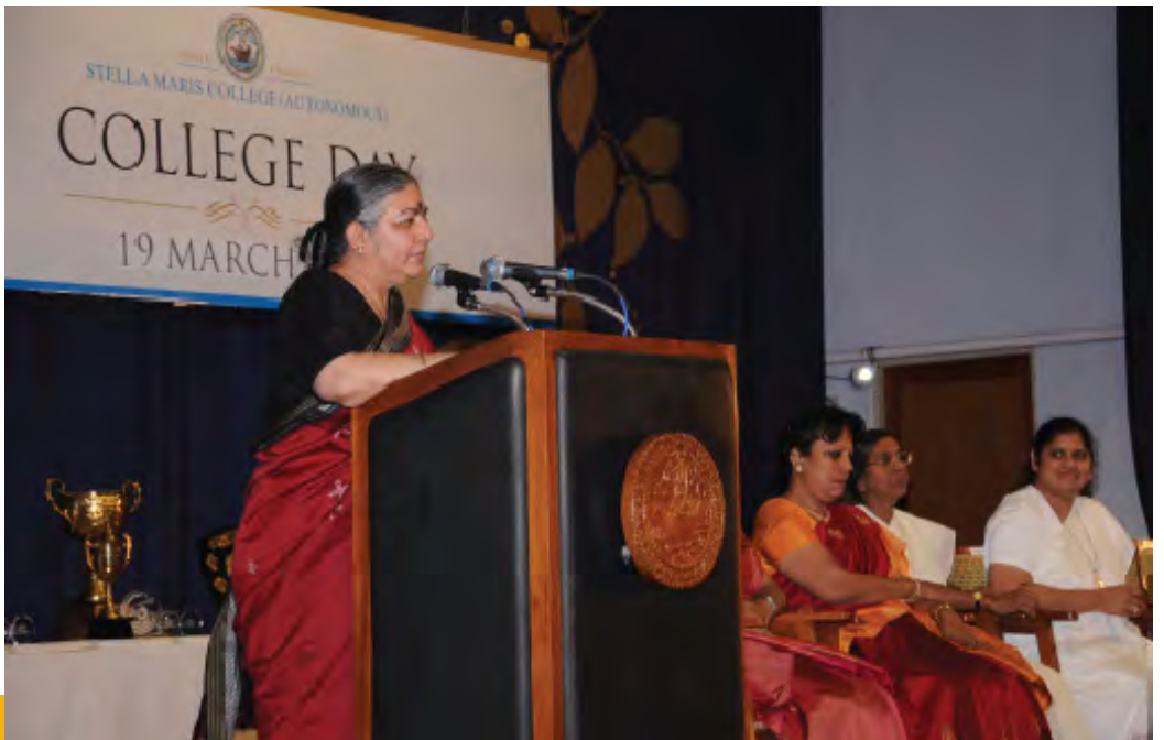
Dr. Vandana Shiva, Chief Guest, addressing the audience on College Day