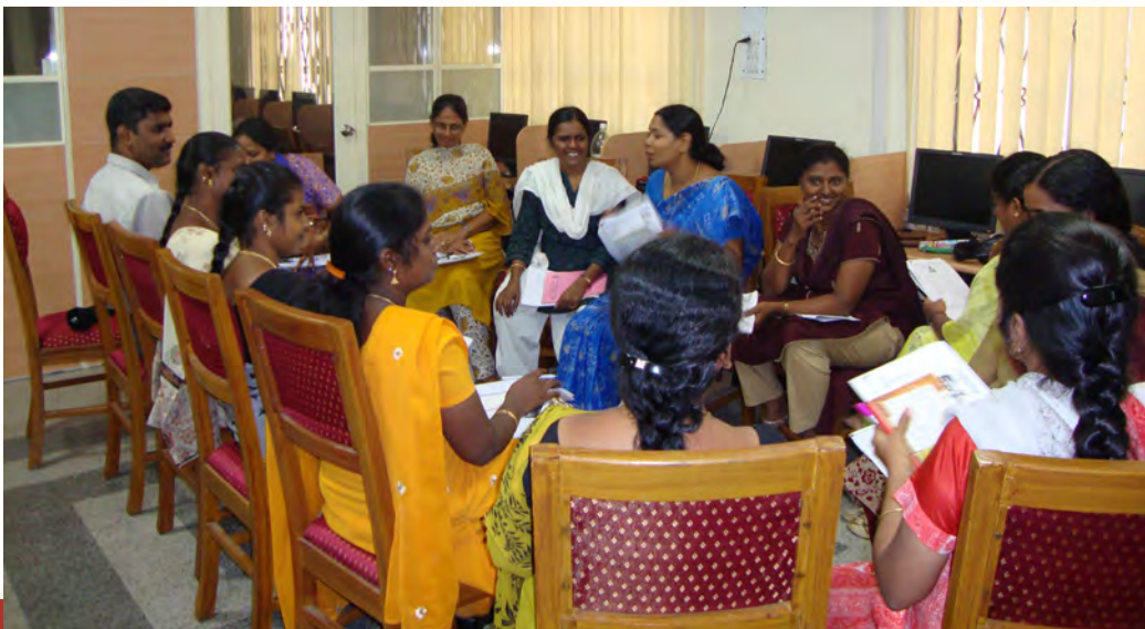
Training Session in official communication for the Administrative Staff