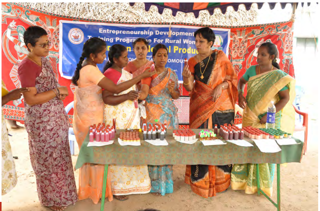
Display of herbal products prepared by rural women