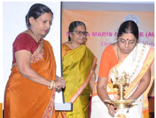
Inauguration of Saatvika, Inter-collegiate Department fest