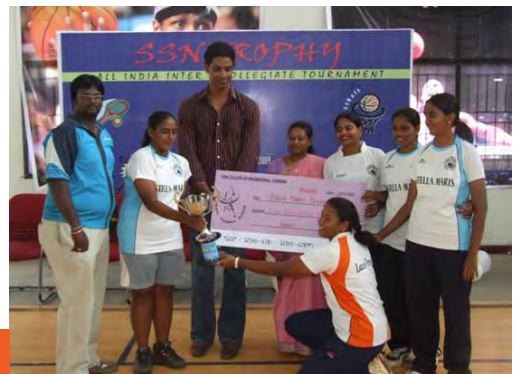
College Tennis Team