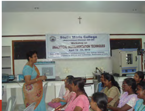
Workshop on 'Analytical Instrumentation Techniques'

The process of implementing this scheme saw a busy year for all the four science departments. New and simple experiments were added to the curriculum to make the learning process more experiment-oriented. Equipment was purchased to enable more students to individually handle regular and relatively new experiments.