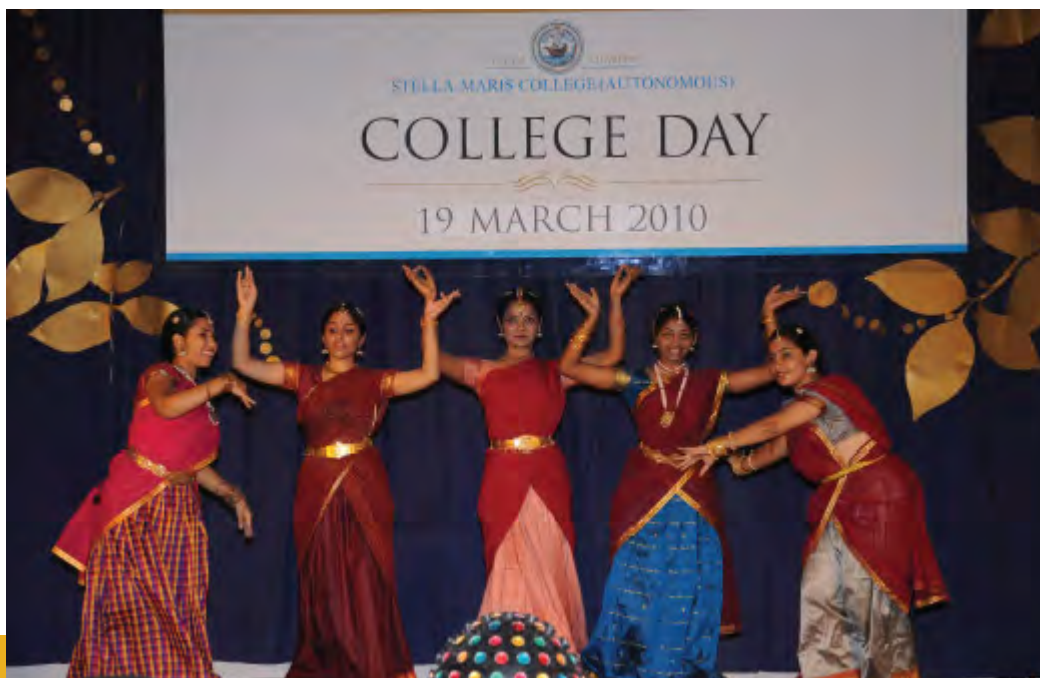
Dancers performing on College Day