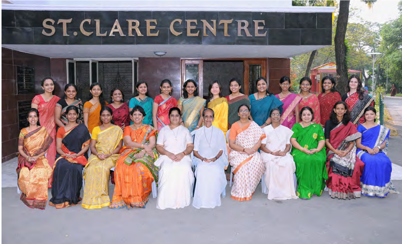
II M.A. Public Relations