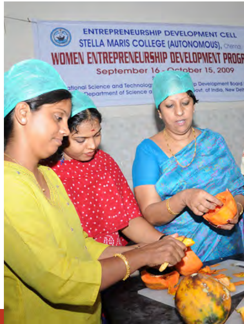
Making papaya jam during the WED programme

The EDC helps in orienting the students to entrepreneurship and serves to motivate them to become successful entrepreneurs. The EDC also imparts skills development training to enhance self/wage employment opportunities. The setting up of the EDC in the college has helped in bringing a new dimension to the curriculum by opening up an inter-disciplinary approach to various projects and imparting skills to students for starting a micro enterprise.