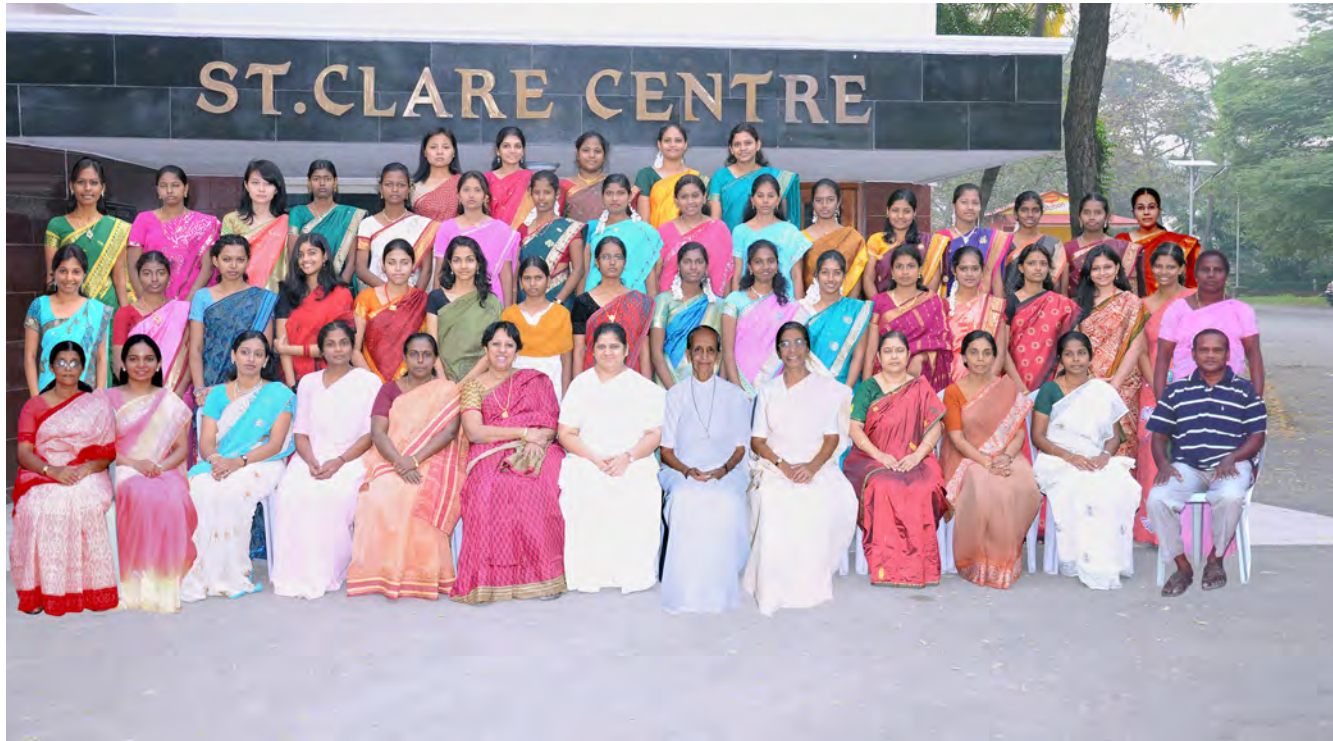
III B.Sc. Physics