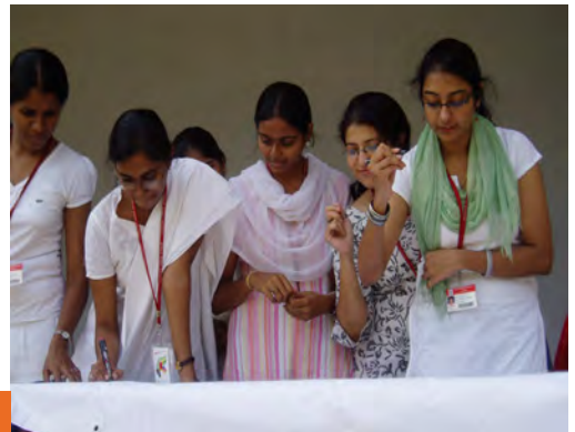
Remembering 26 November Solidarity Campaign

General, Indian Coast Guard, currently Professor and Head, School of Management Studies, National Institute of Technology, Calicut, dwelt upon the essentials of geostrategic security.