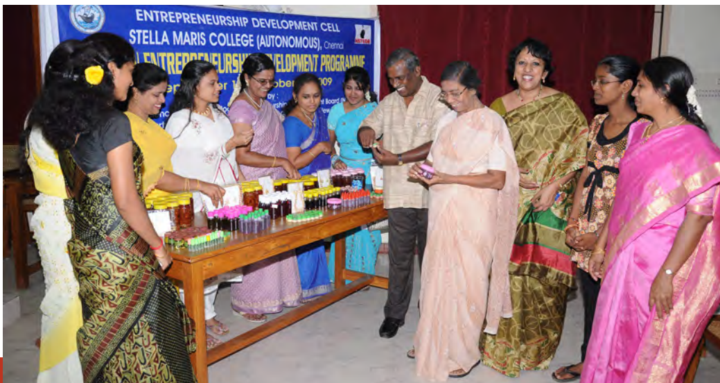
Women entrepreneurs display their herbal products