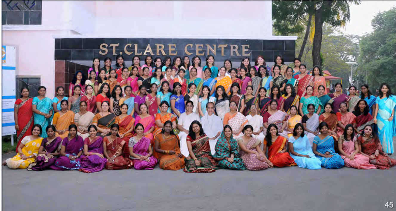
III B.Com. (A1)