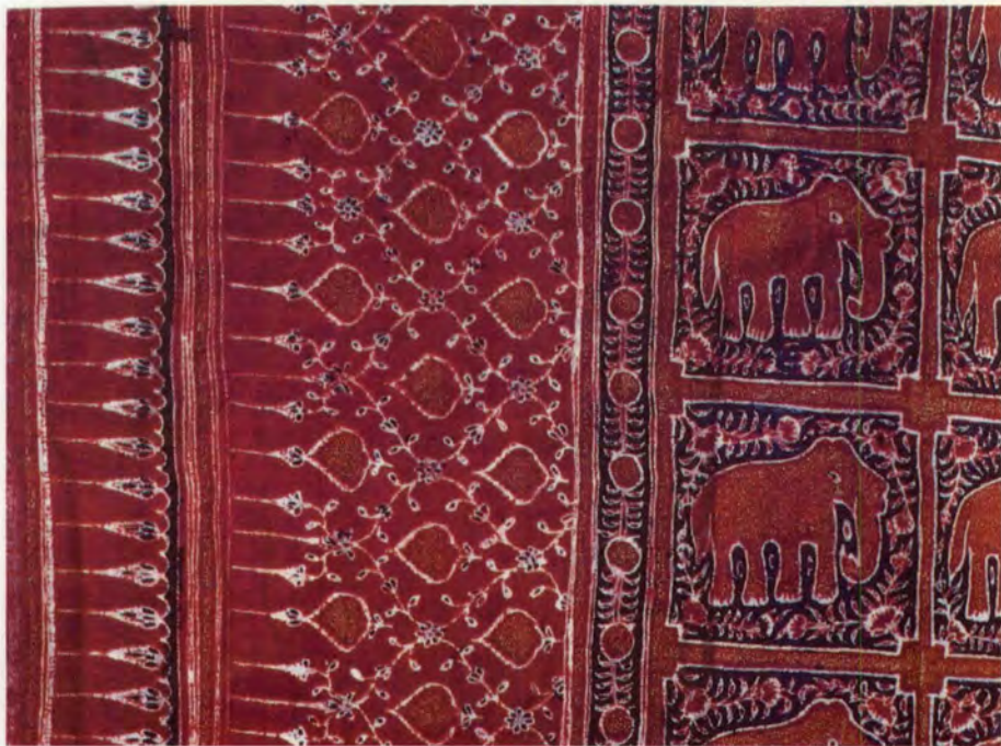
Fig.2. Kodalkarupur Saree (Thanjavur)