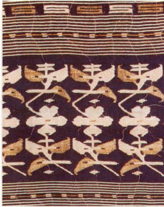
Fig.1. Jamdani (West Bengal)