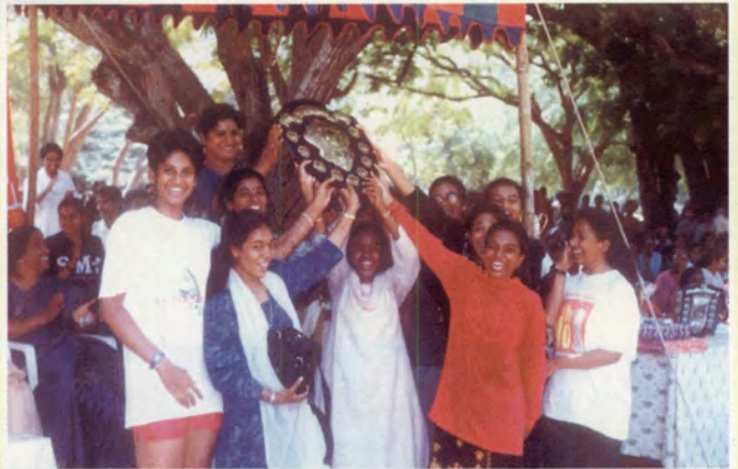
The triumphant PGs - Sports Day '99.