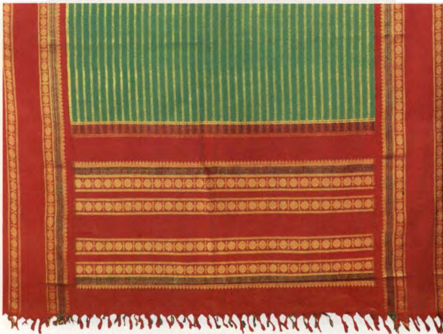
Fig.4. Kanchipuram Silk Saree