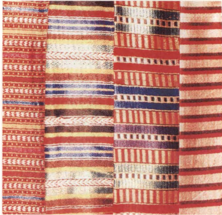
Fig.3. Mashru (Cotton & Silk mix)