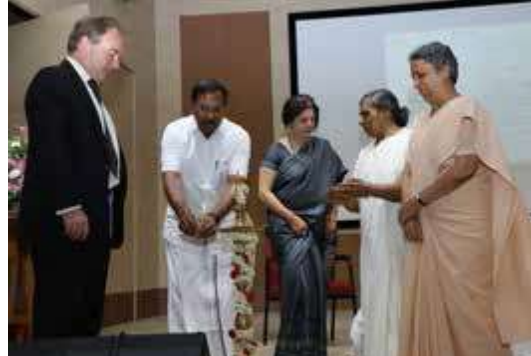
International Conference - Innovation and Transformation, the Leading Edge in Global Business

Commerce, Shift - I: The academic year 2018 - 2019 was an enriching one for the Department of Commerce, Shift - I. The Department conducted several conferences, workshops, guest lectures and cultural events this year. An International workshop was