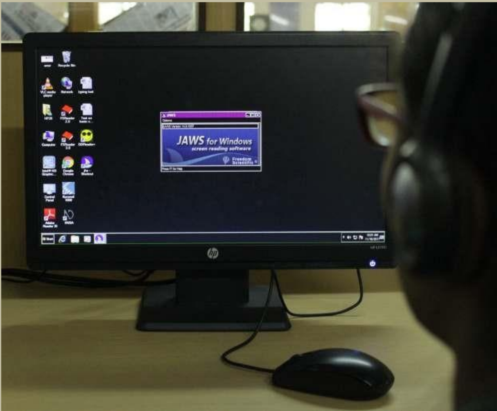
Special Software (JAWS) and Computer Facility for Visually Challenged Students at the College Library