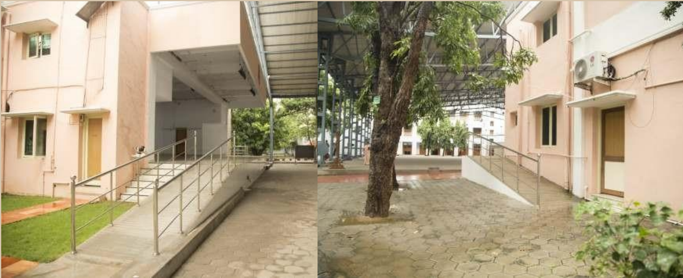
Ramp Facility for Access to OAT Stage