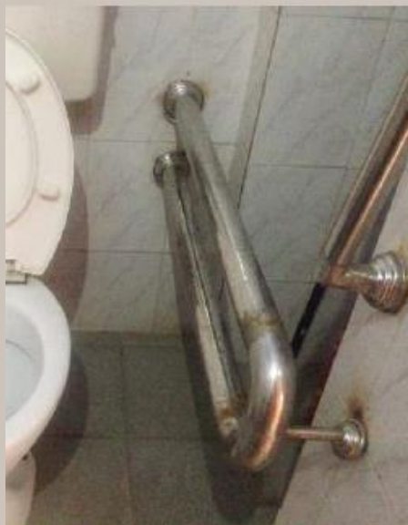
Restroom Facility with Wheelchair access on every floor of Sancta Sofia Block