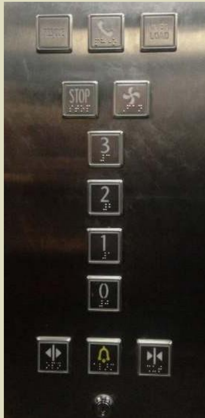
Elevator Facility with Braille Buttons at St. Clare Centre