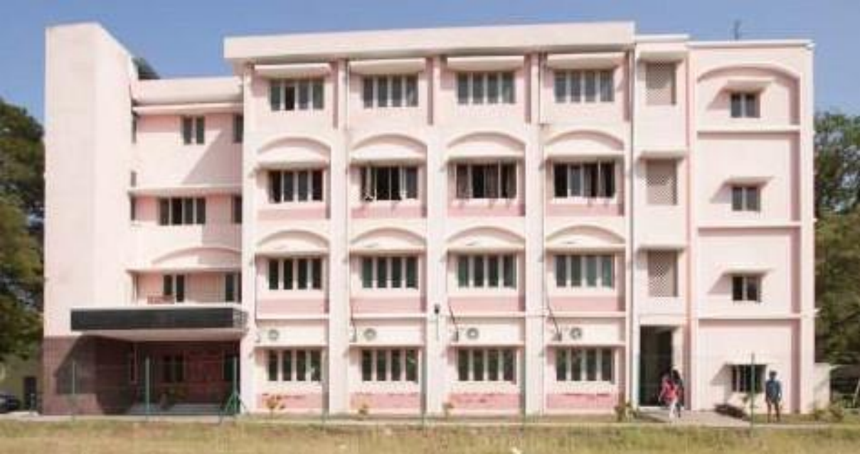
Ramp Facility at Hélène de Chappotin Block