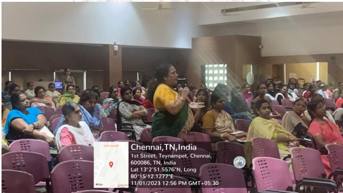
Faculty interaction during the session