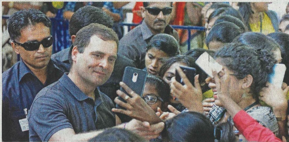
Congress president Rahul Gandhi takes a selfie with students at Stella Maris Women's College in Chennai on Wednesday.

Indirectly alluding to Modi's "Make in India" initiative, Rahul said Congress would do better with a "Make in Tamil Nadu" programme. "Tamil Nadu has the potential to emerge as the manufacturing capital of the world", he declared and vowed to create a brand 'Made in Tamil Nadu' for products manufactured in the state when his UPA