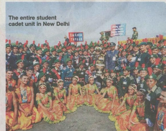
The entire student cadet unit in New Delhi