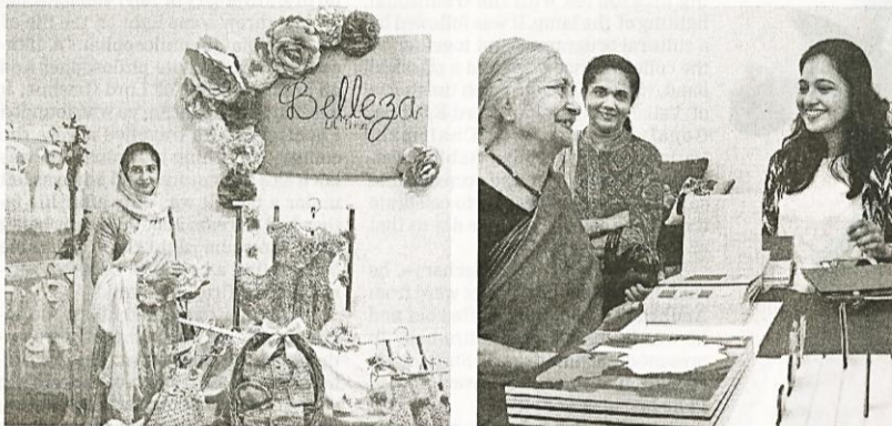
Final year students of the Dept of Fine Art, Stella Maris, with their exhibits