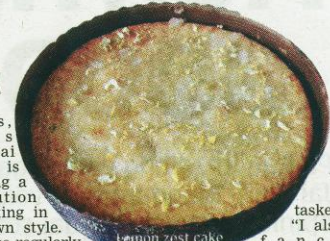
lemon zest cake