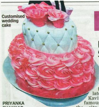
Customised wedding cake