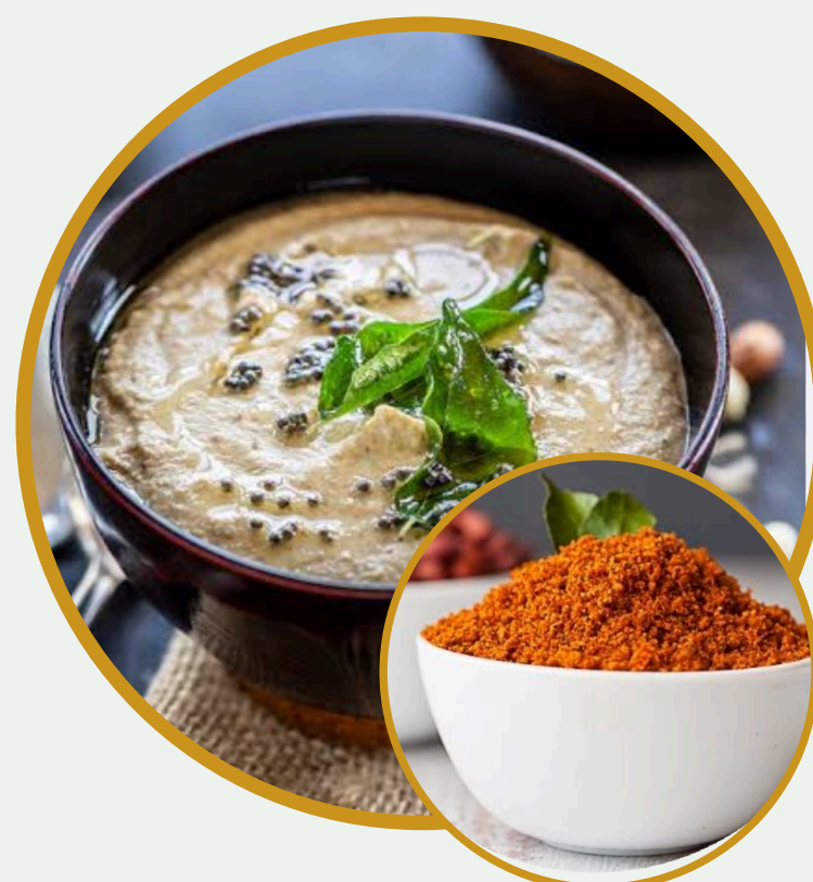
PEANUT CHUTNEY MIX - ₹75