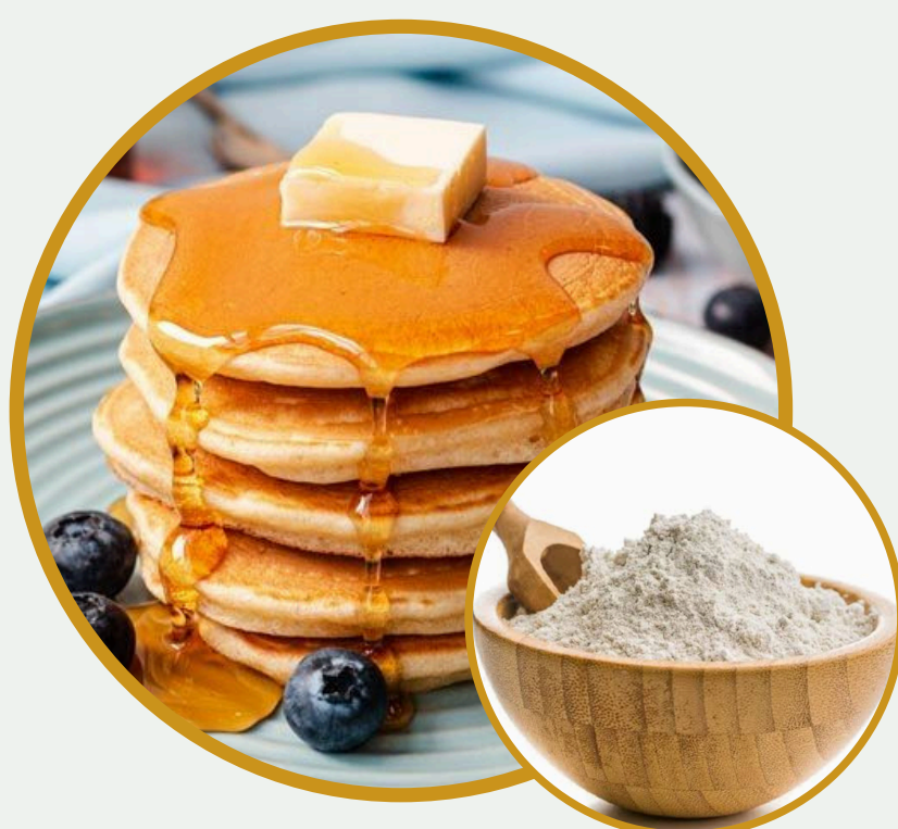
FLUFFY PANCAKE MIX - ₹80