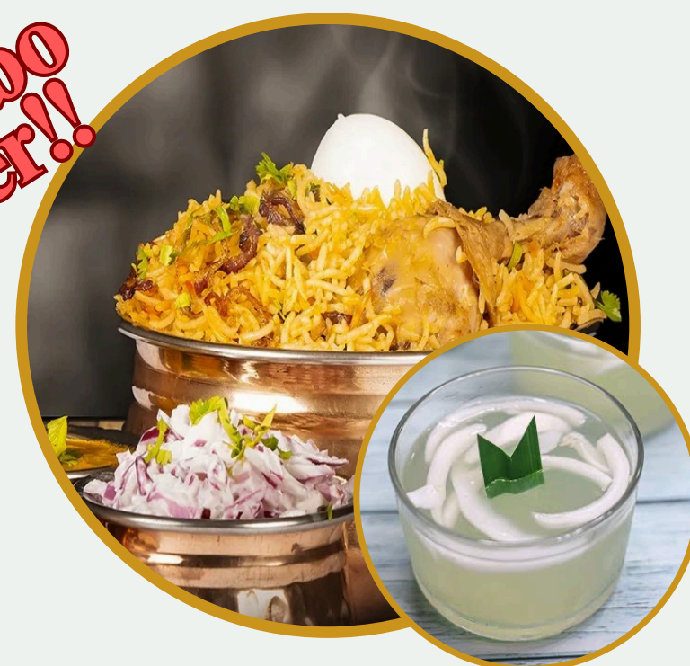
BIRIYANI+ PUDDING - ₹180