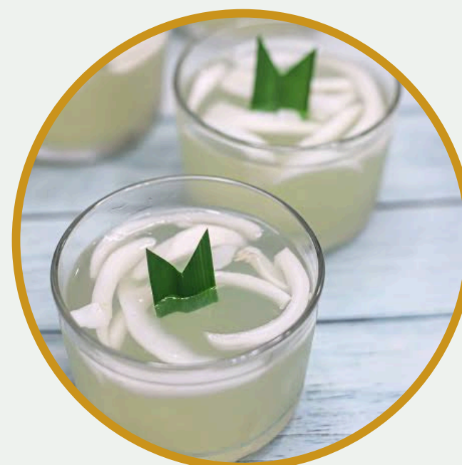
TENDERCOCONUT PUDDING - ₹35