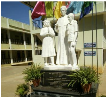
Don Bosco College Yelagiri