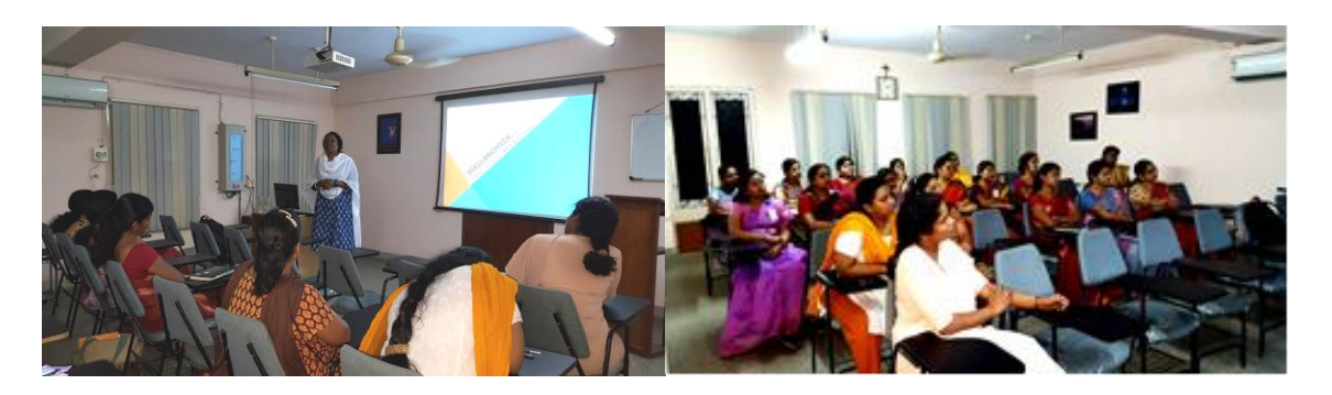
Meeting of the Stellarchives representatives - 24th July, 2015

❖ This year, the annual meeting of the Stellarchives representatives was held on 24<sup>th</sup> July, 2015. The chief objective of this meeting was to brief the representatives from the various departments about the aims and objectives of the Archives and to elicit their collaboration. The representatives were asked to concentrate this year on collecting theses and synopses from all the faculty - both past and present - who have completed their doctorate, so that they can be preserved in the archives