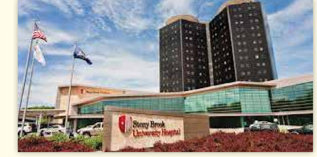
Stony Brook University, USA: 2012 - Ph.D. (Genetics)