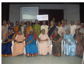
Logo released on 20 July 2010