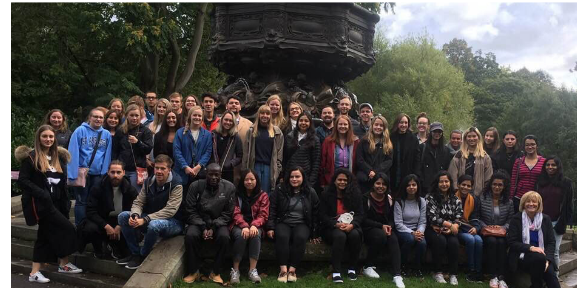
IMBA 2018-2019 batch