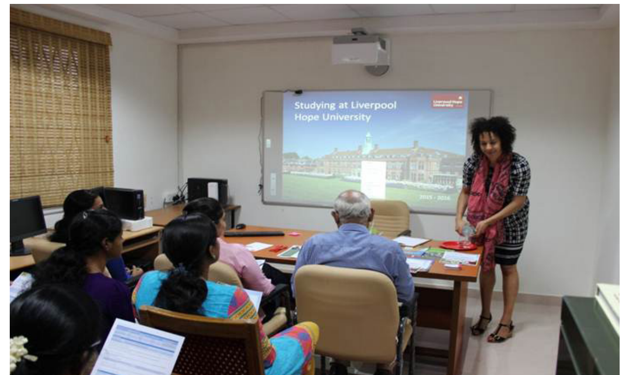
Orientation on LHU