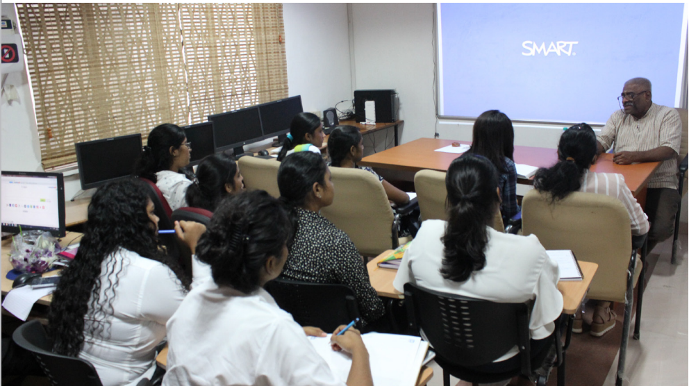
Sessions at Stella Maris College, Chennai