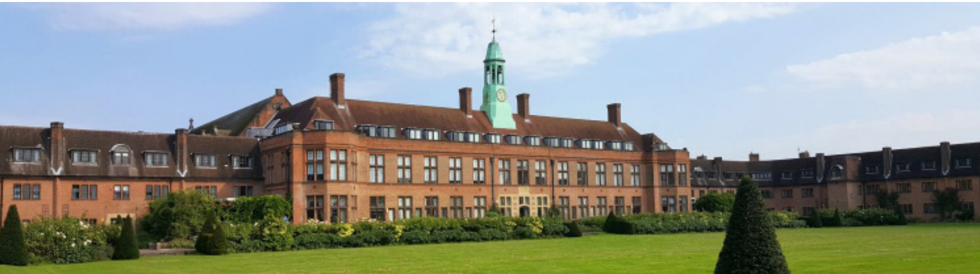
Liverpool Hope University (LHU), UK