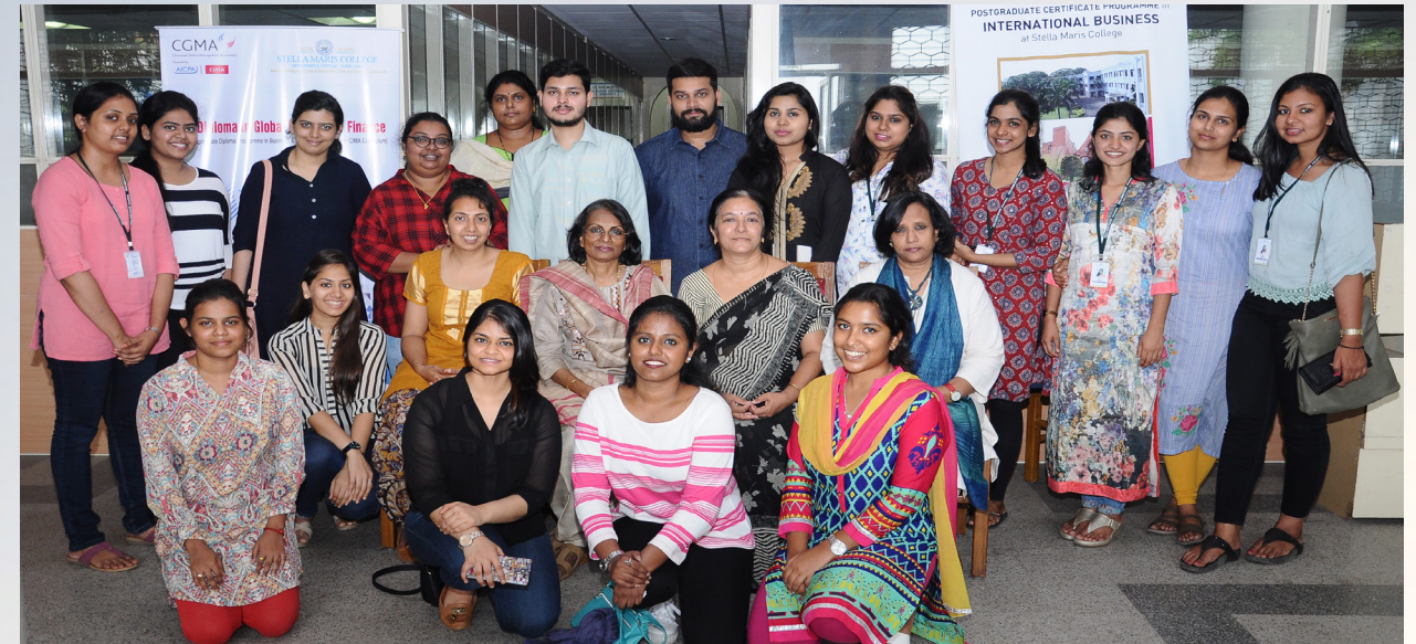
PCIB Social meet