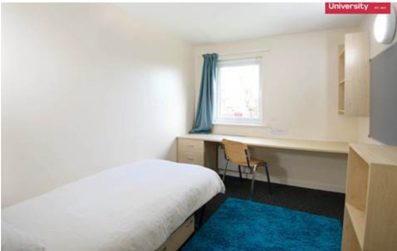
St. Michael's Hall