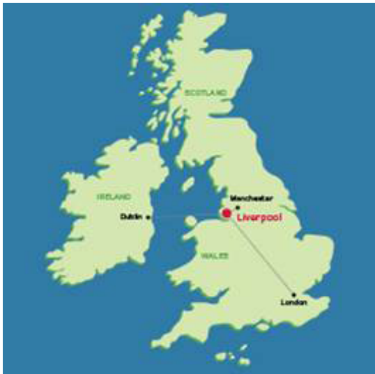
Where we are?