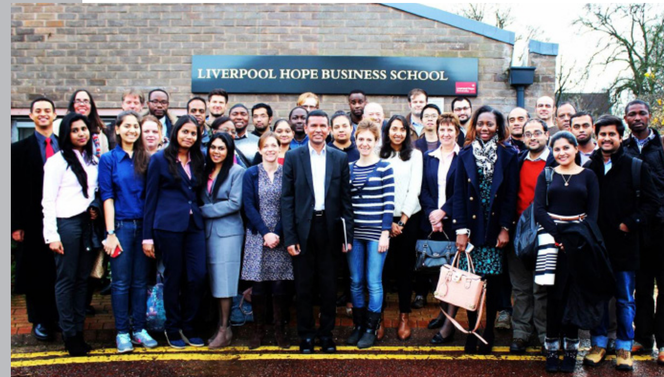
IMBA Team 2015-16