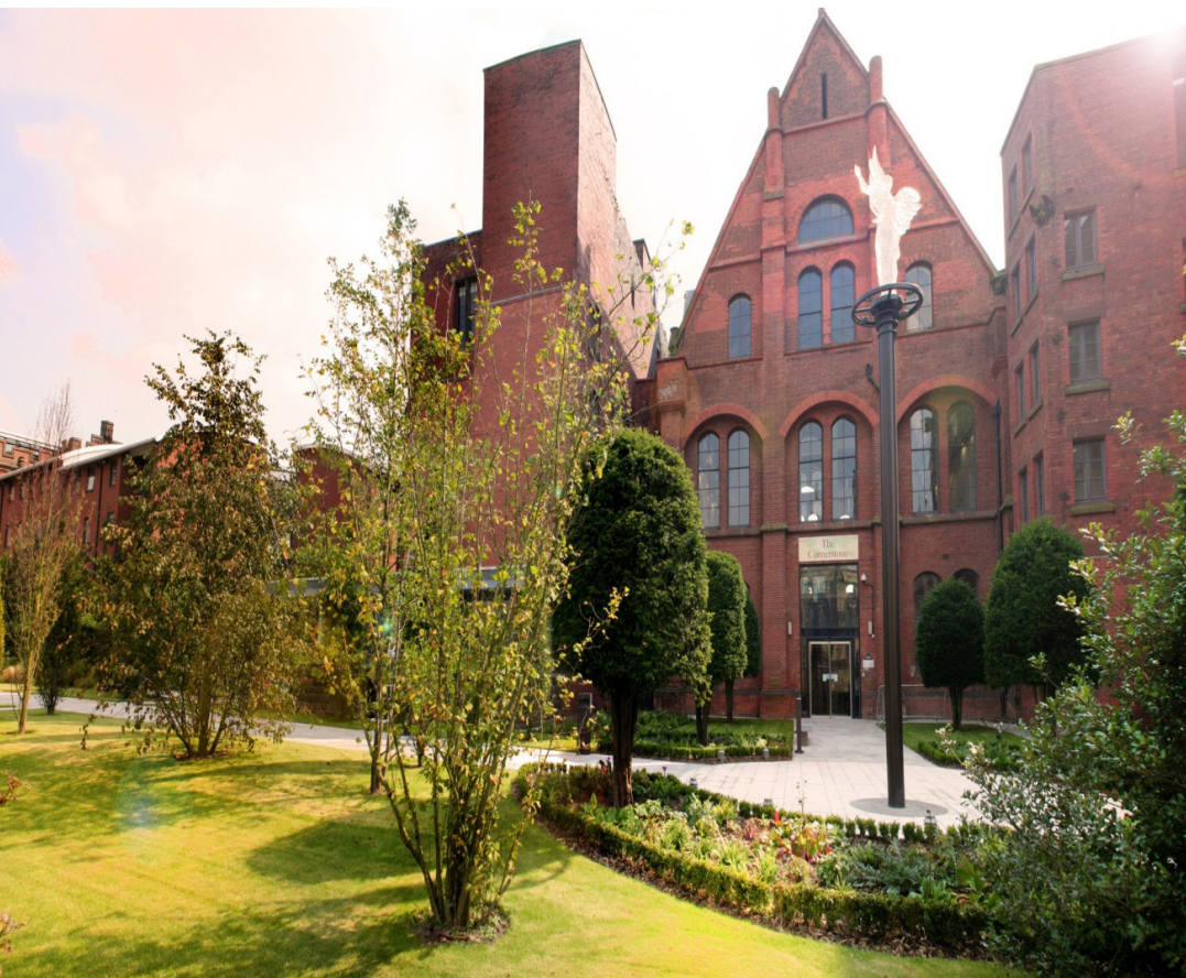
Liverpool Hope University, UK