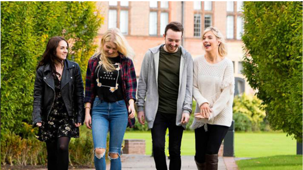
Hope Campus, UK