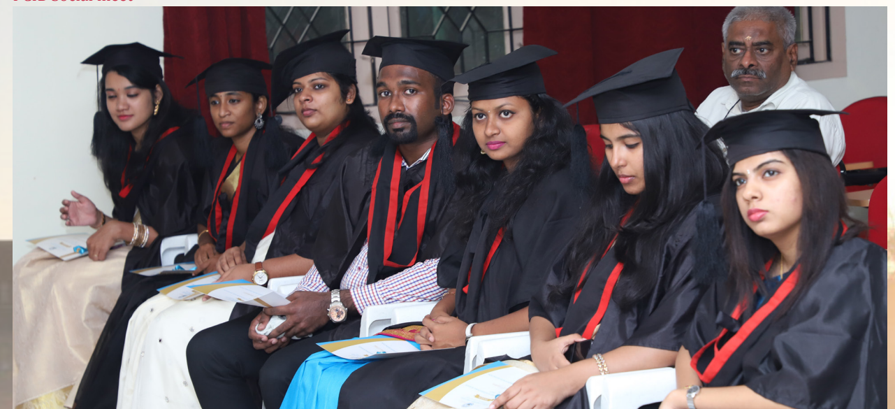
PCIB Graduation 2018-2019