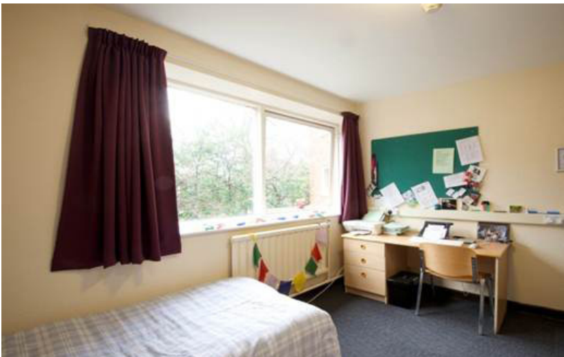
St. Julie's Hall