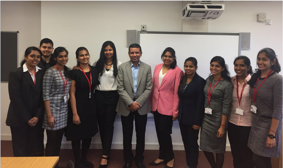
2017-2018 class at LHBs, UK