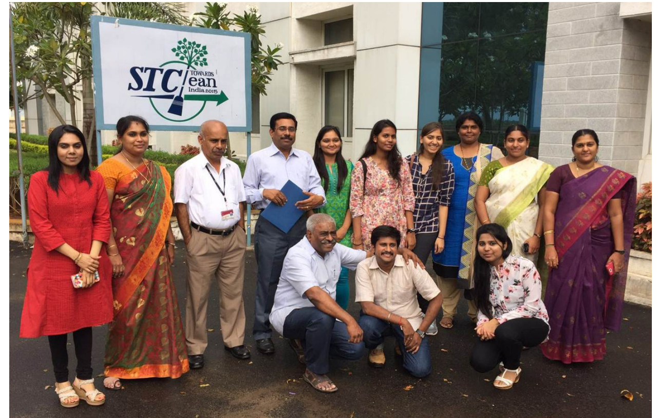
PCIB Field Visit 2016

For further information visit http://www.stellamariscollege.org/career_guidance.php