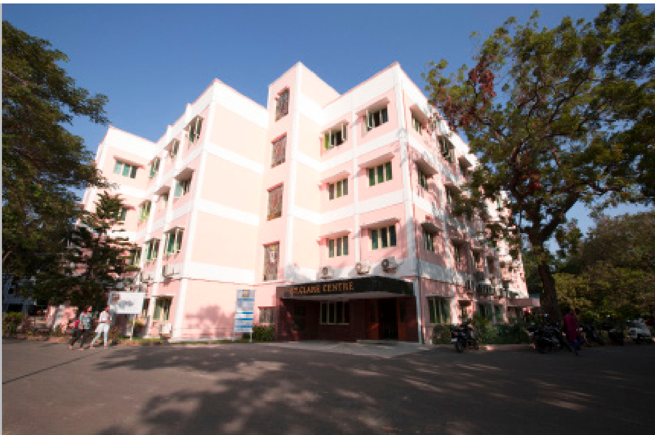
Stella Maris College Chennai