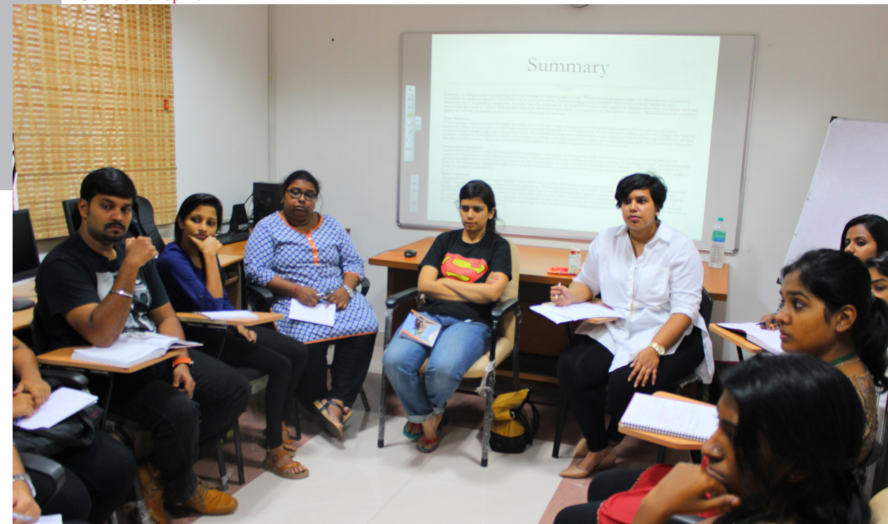
PCIB Workshop 2017