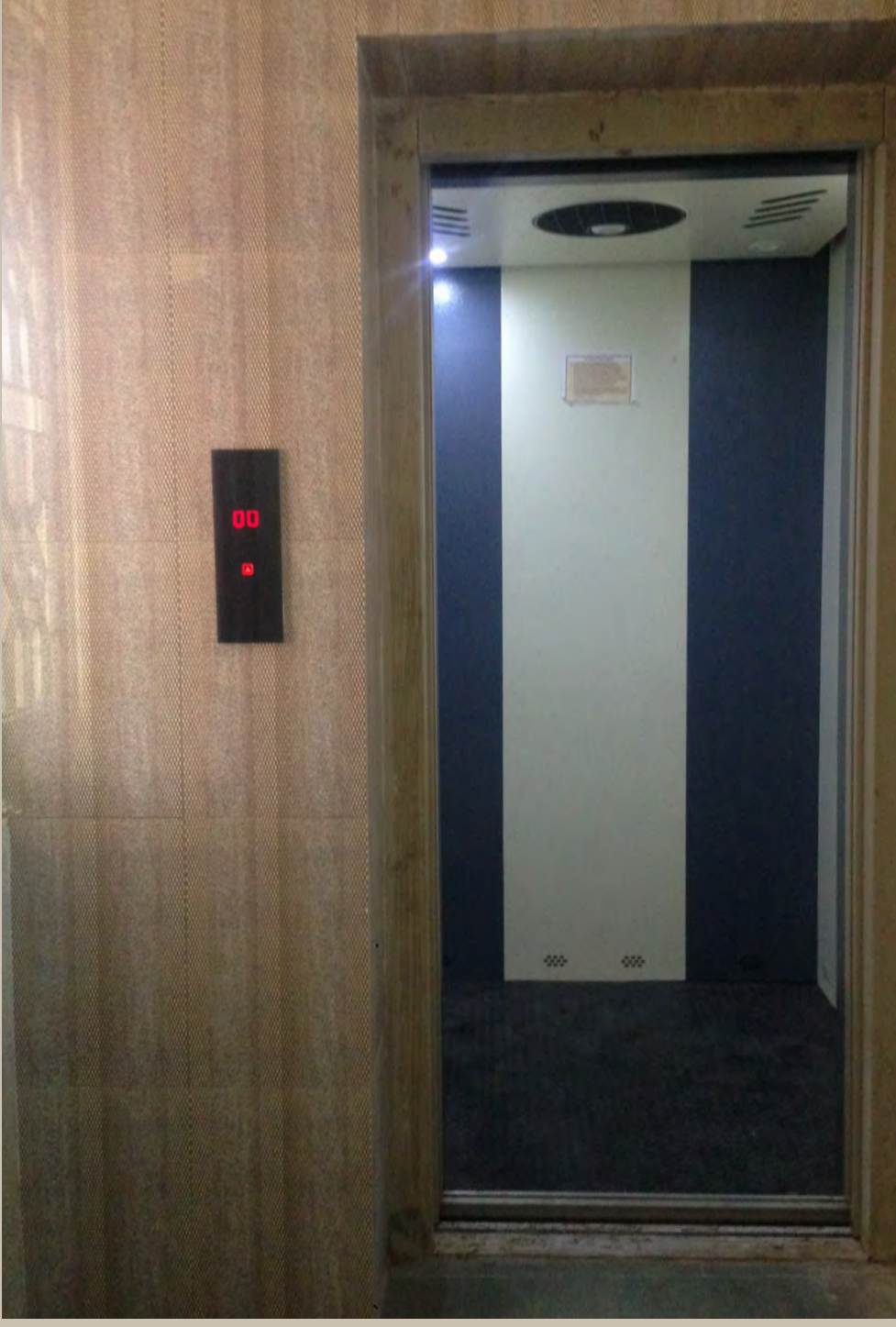
Ramp and Elevator Facilities at Hélène de Chappotin Block