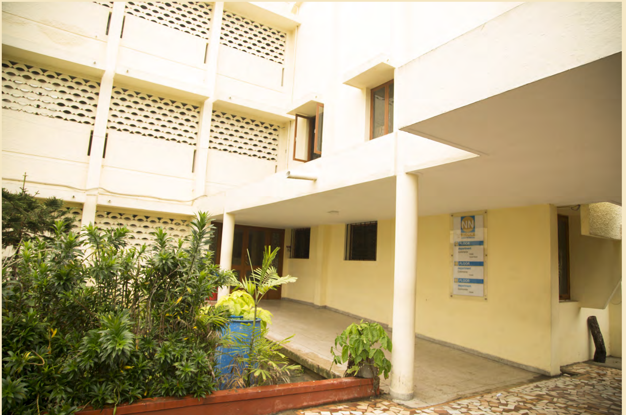
Ramp Facility at Nava Nirmana Block