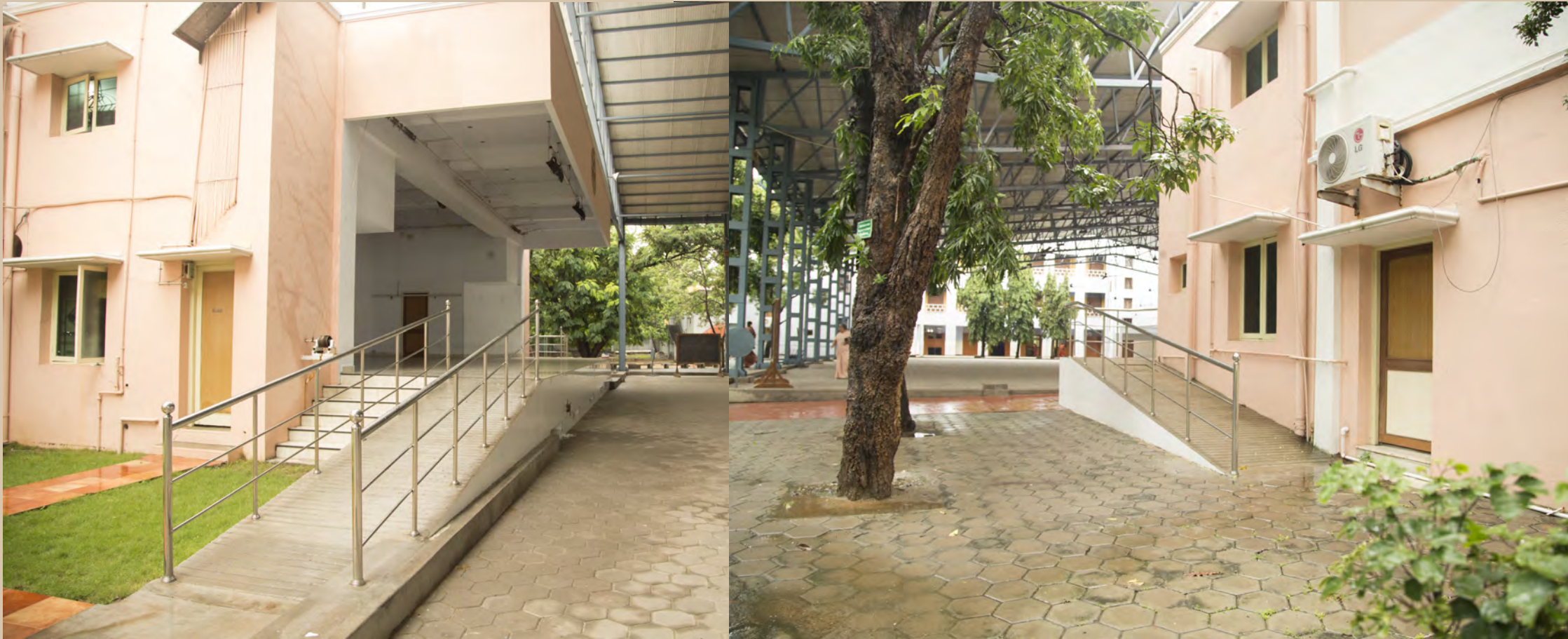
Ramp Facility for Access to Open Air Theatre Stage