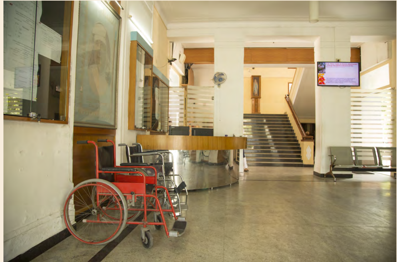
Elevator Facility and Wheelchairs for Special Students at Main Block