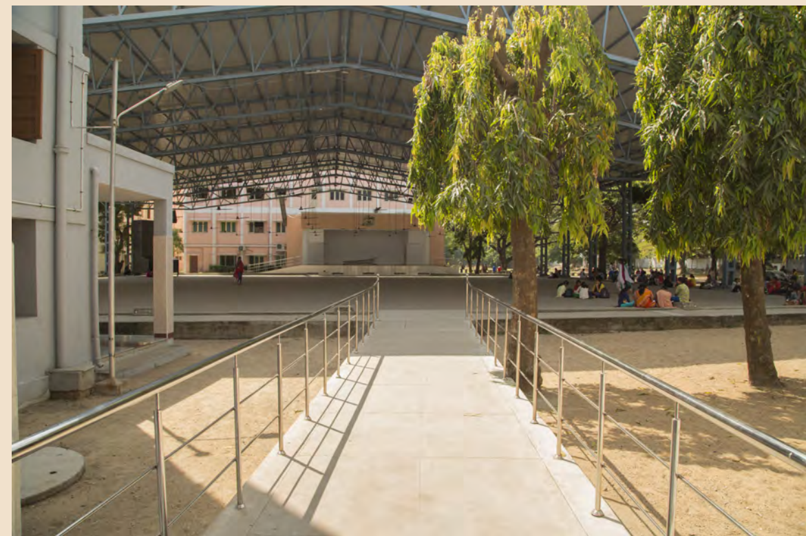
Ramp Facilities between Main Block and Open Air Theatre