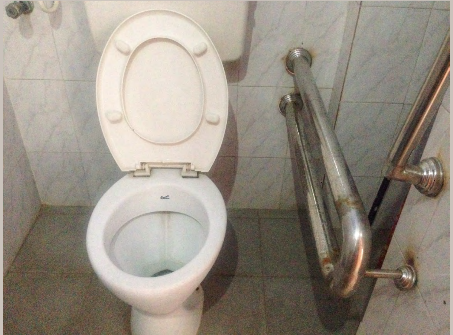
Special Restroom Facility for Students with Disabilities at Main Block