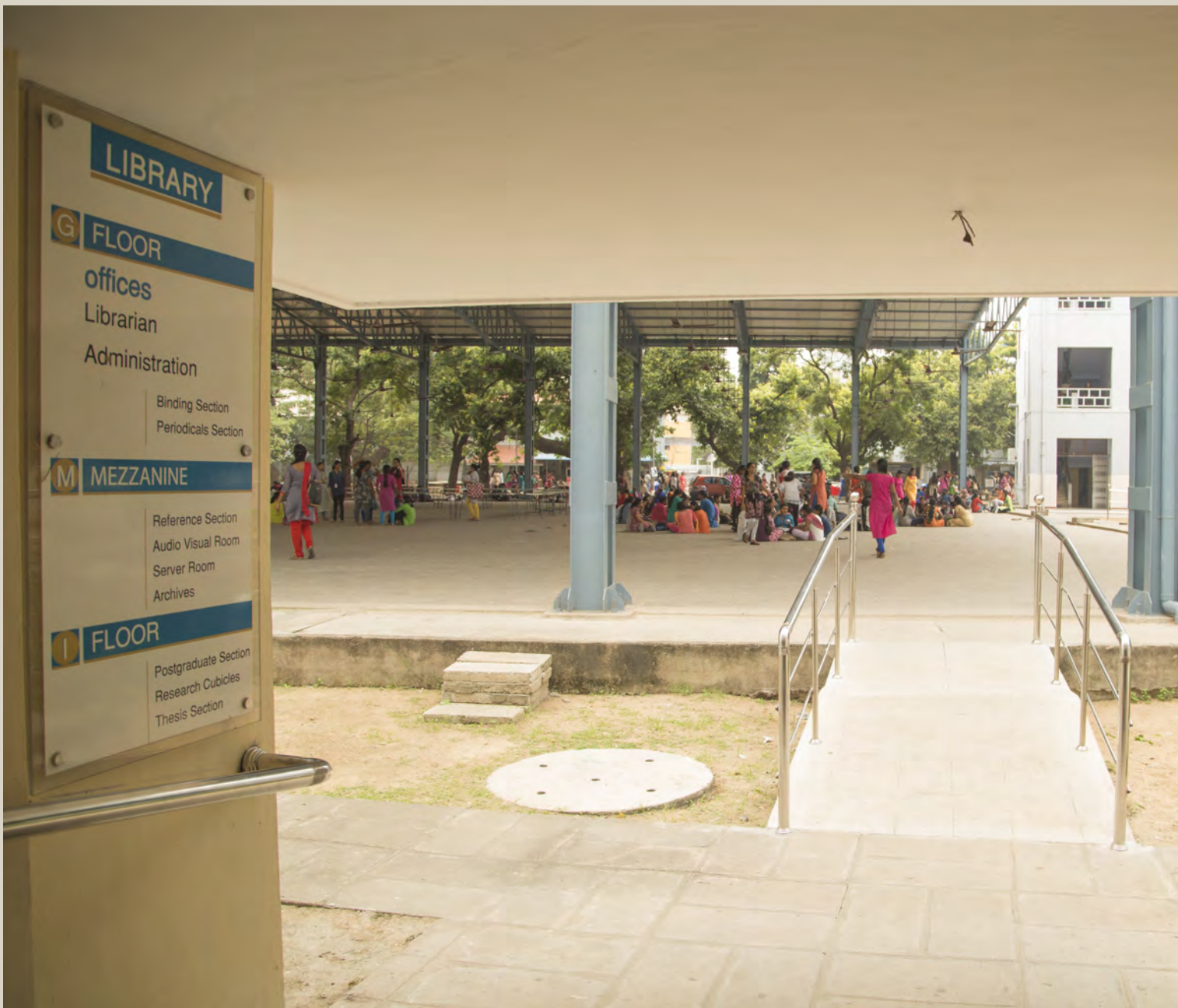
Ramp Facility to Access the College Library