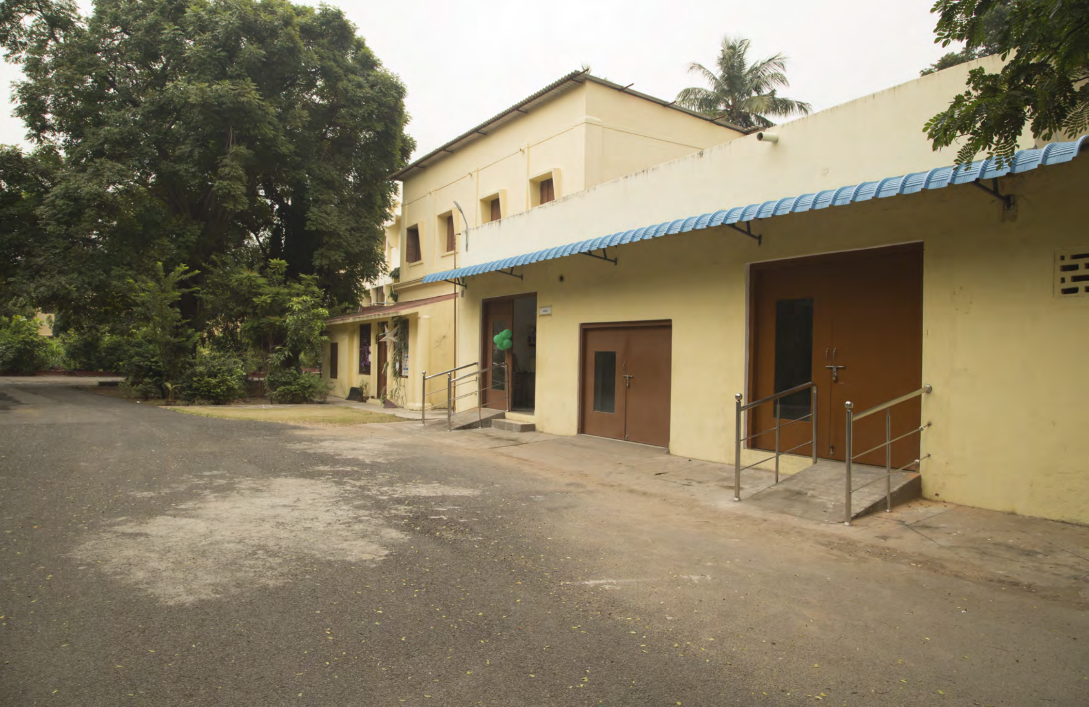
Ramp Facility at Games Room