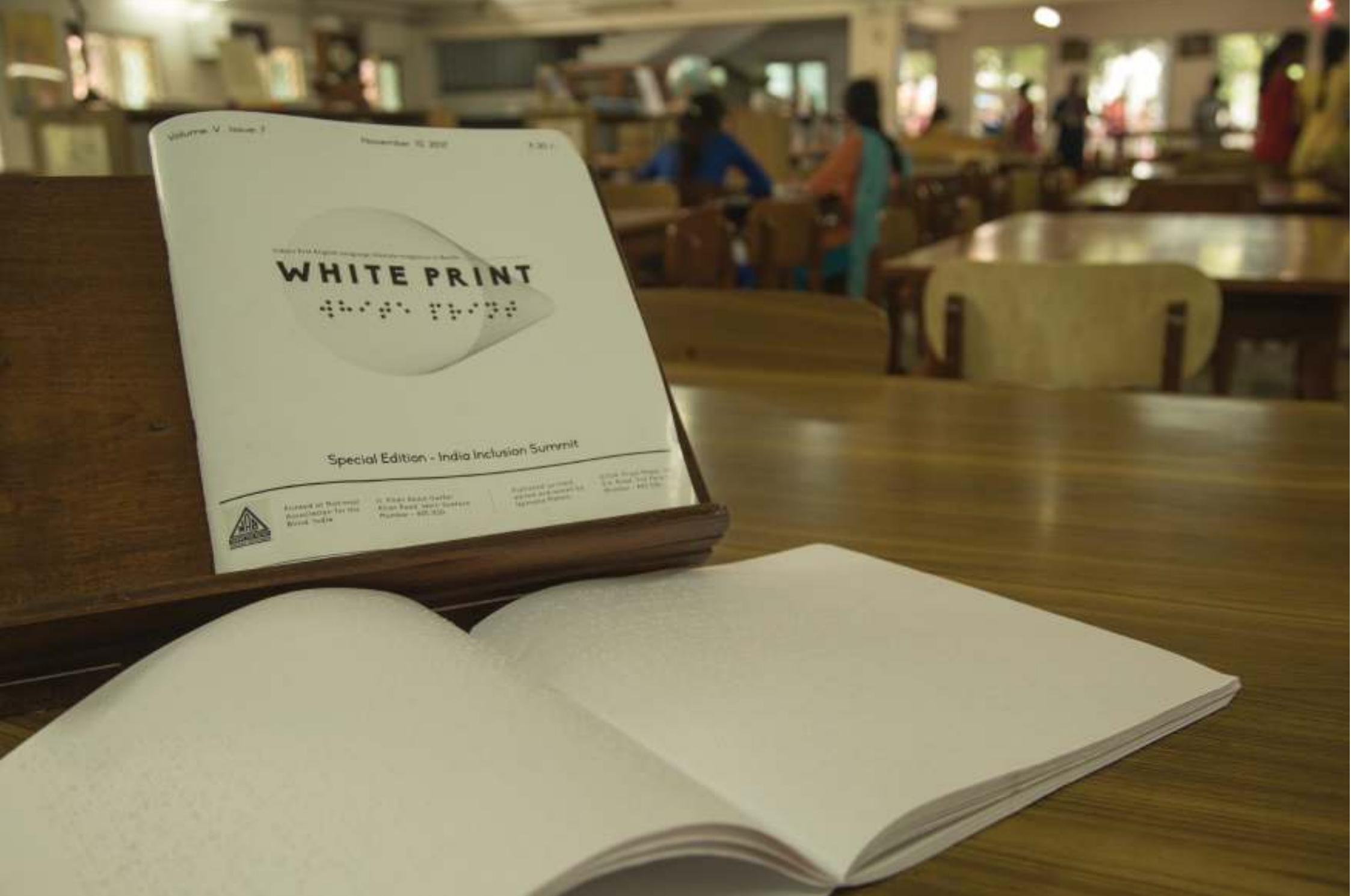
Braille Magazine—White Print