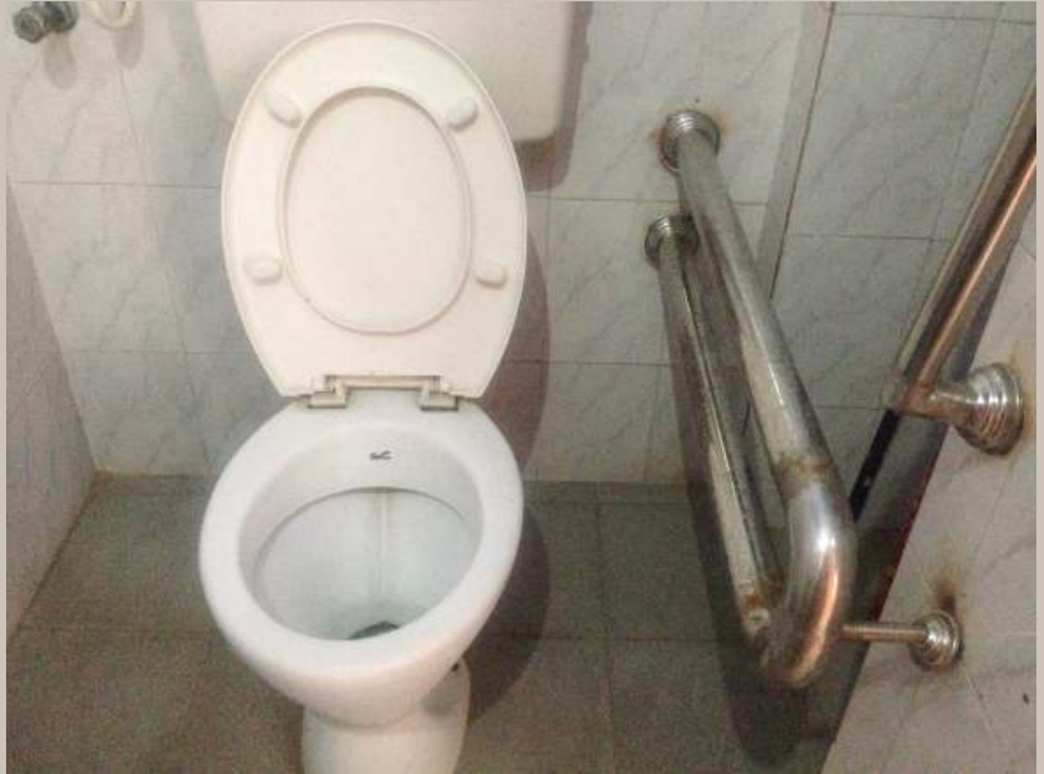
Special Restroom Facility