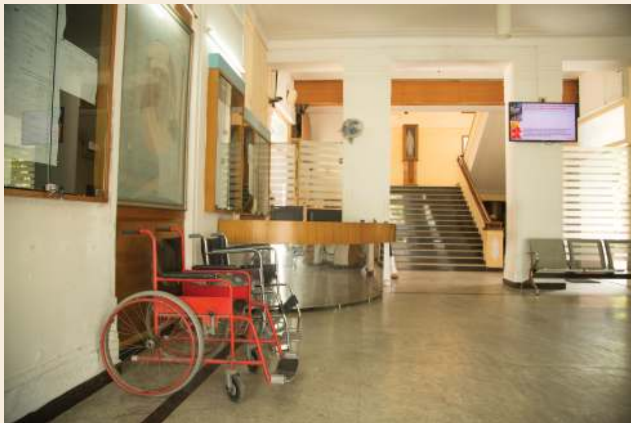
Elevator Facility and Wheelchairs for Special Students at Main Block