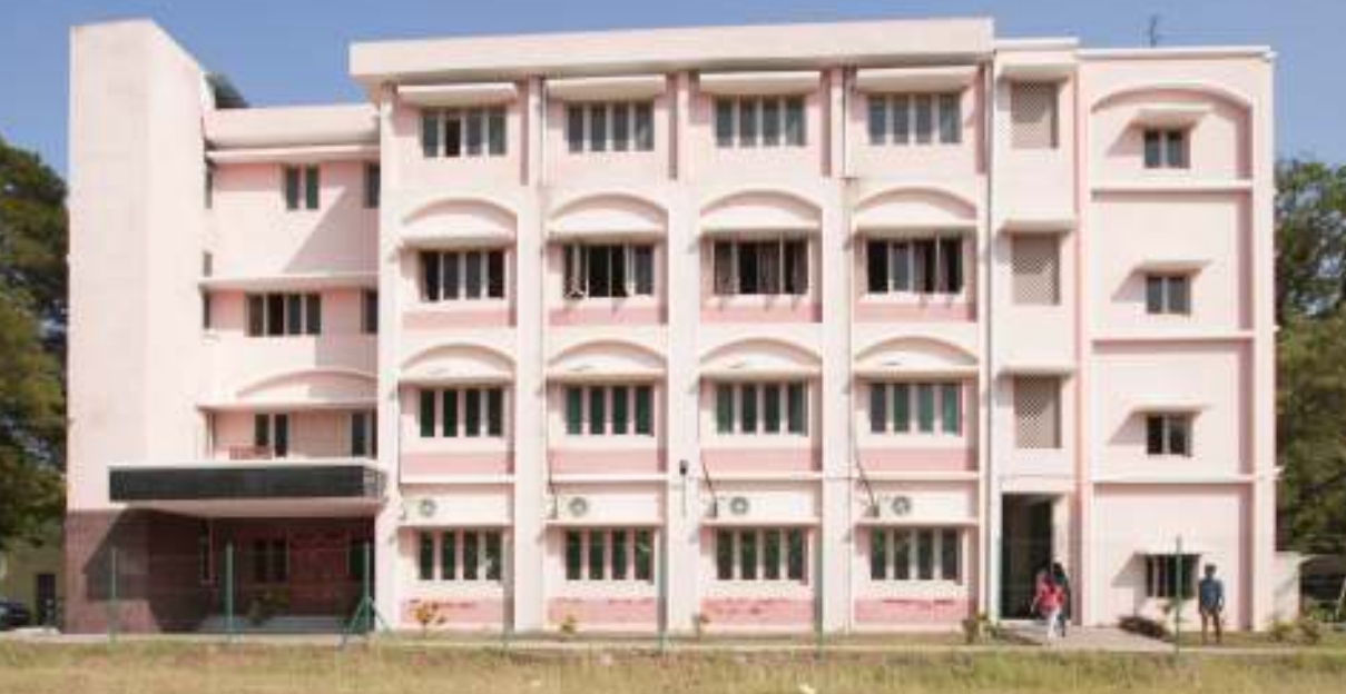
Ramp Facility at Hélène de Chappotin Block