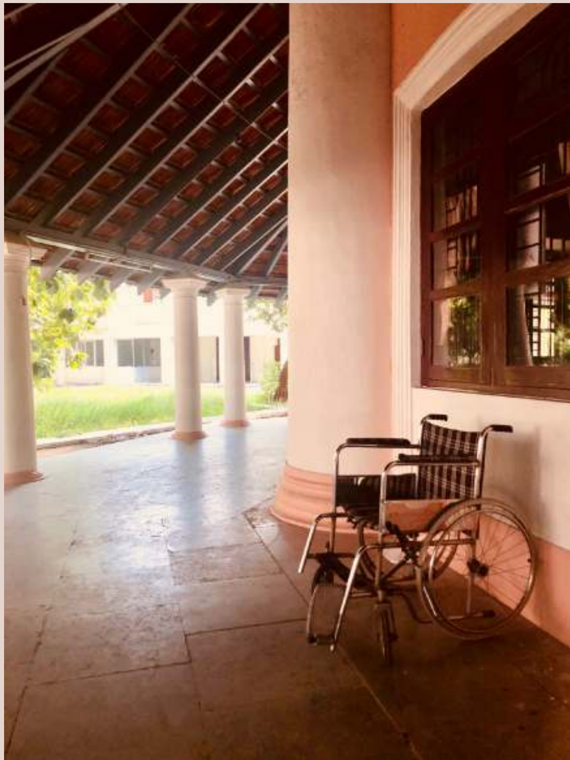
Wheelchair for Special Students at B Block