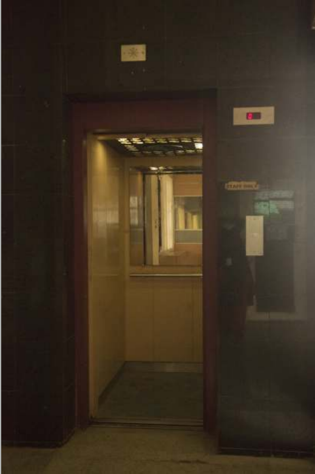
Elevator Facility at St. Francis Block