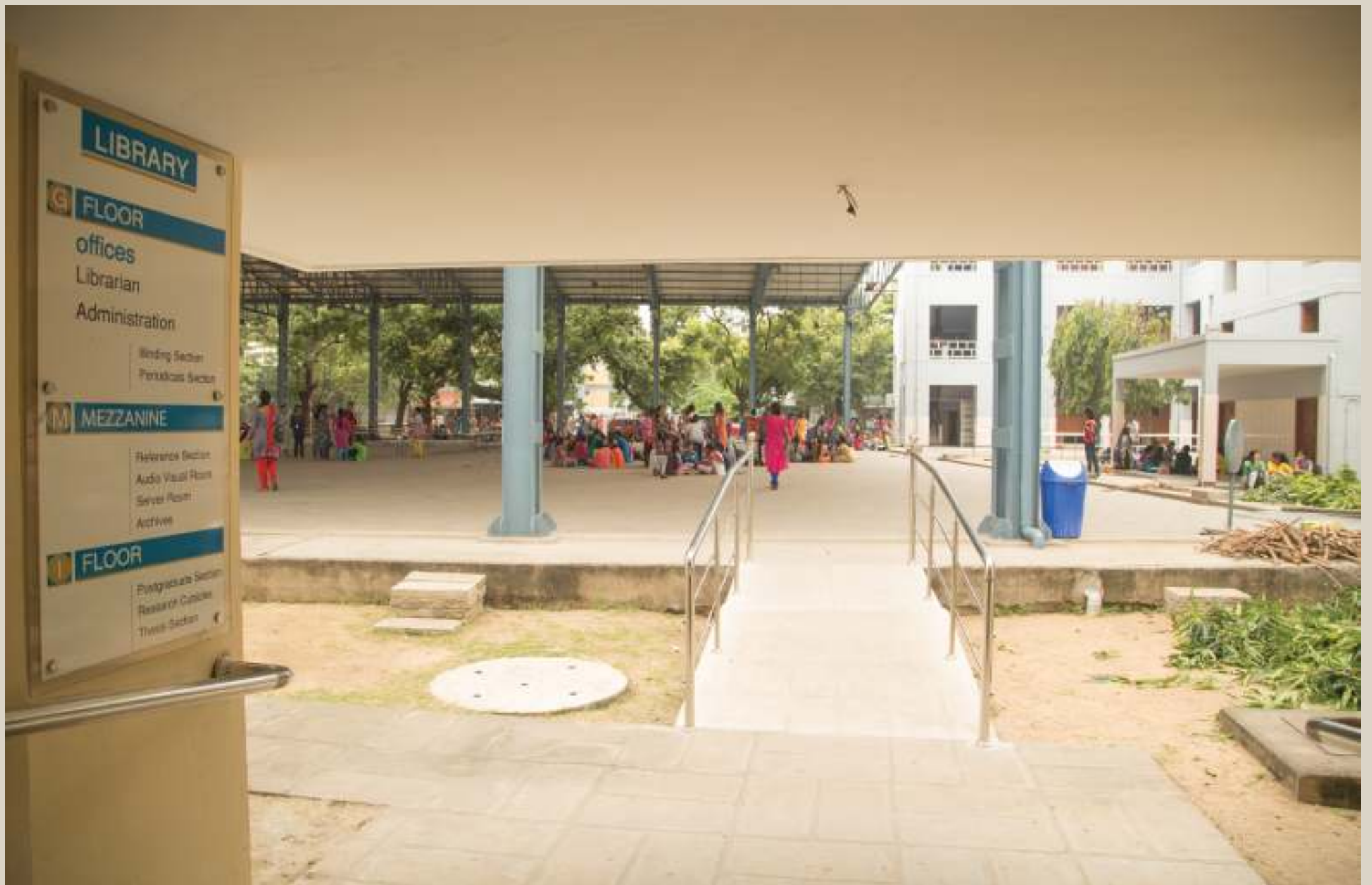
Ramp Facility to Access the College Library from the OAT