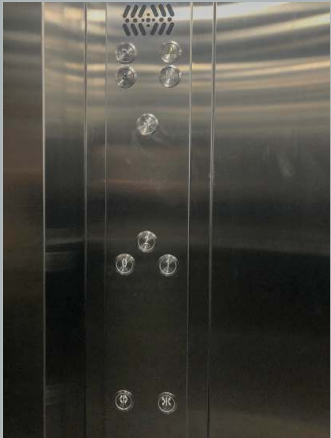
Elevator Facility with Braille Buttons at Snehalaya Hostel