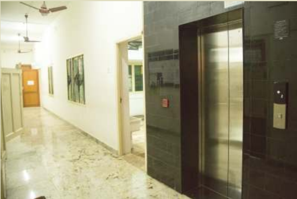
Elevator Facility with Braille Buttons at St. Clare Centre