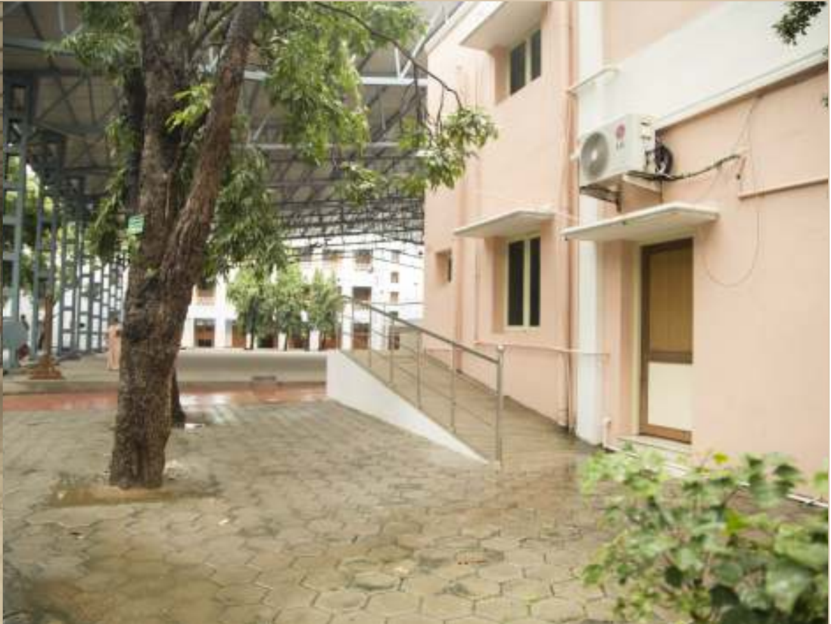
Ramp Facility for Access to OAT Stage