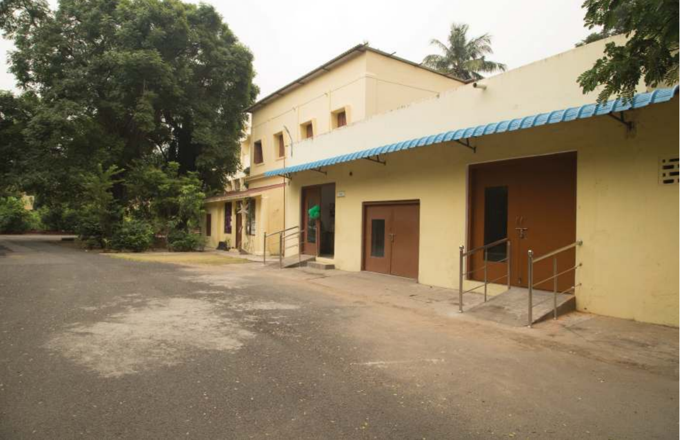
Ramp Facility at Games Room