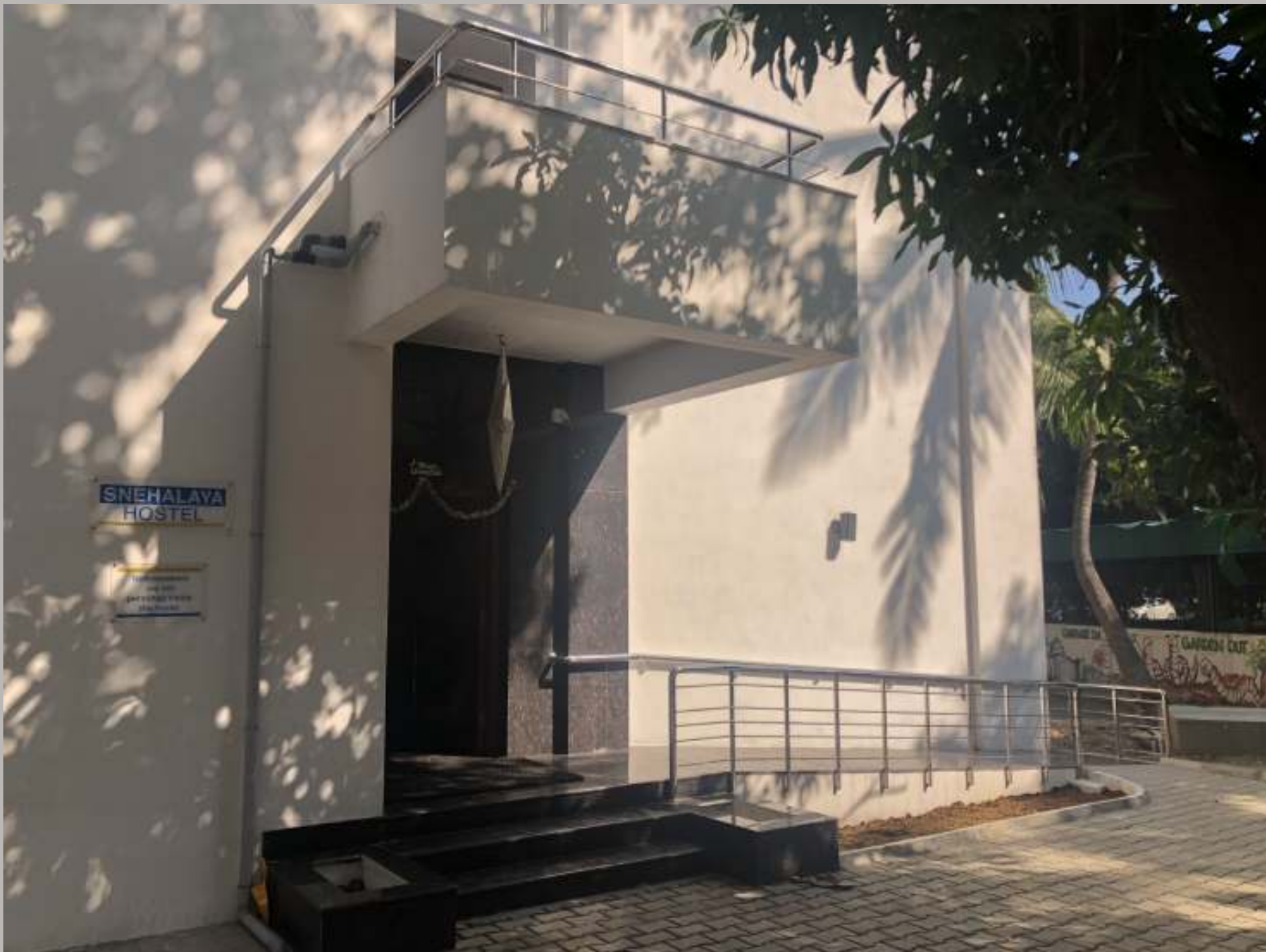
Ramp Facility at Snehalya Hostel