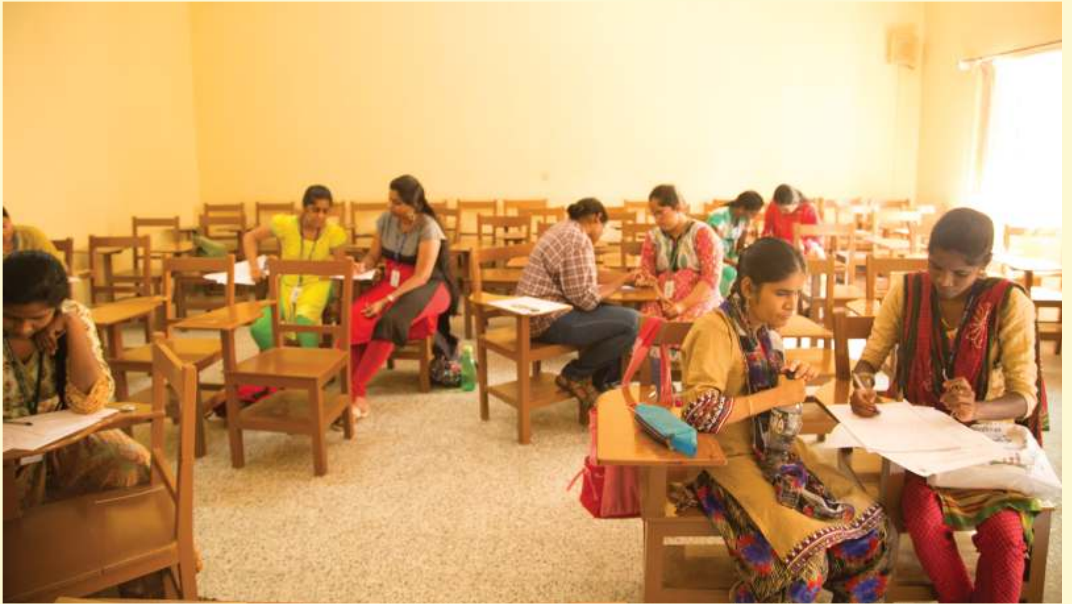
Scribing Services for Special Students