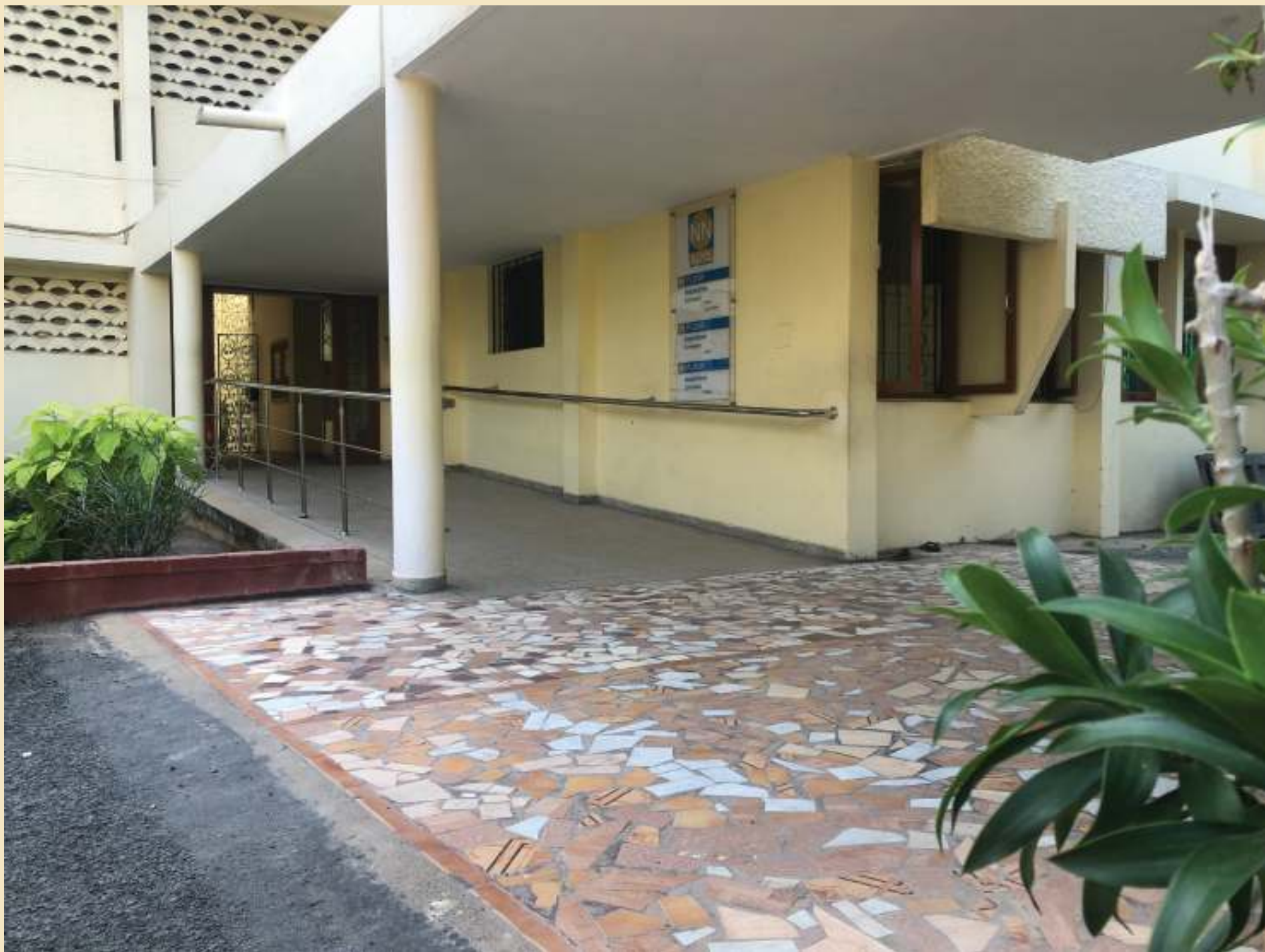
Ramp Facility at Nava Nirmana Block