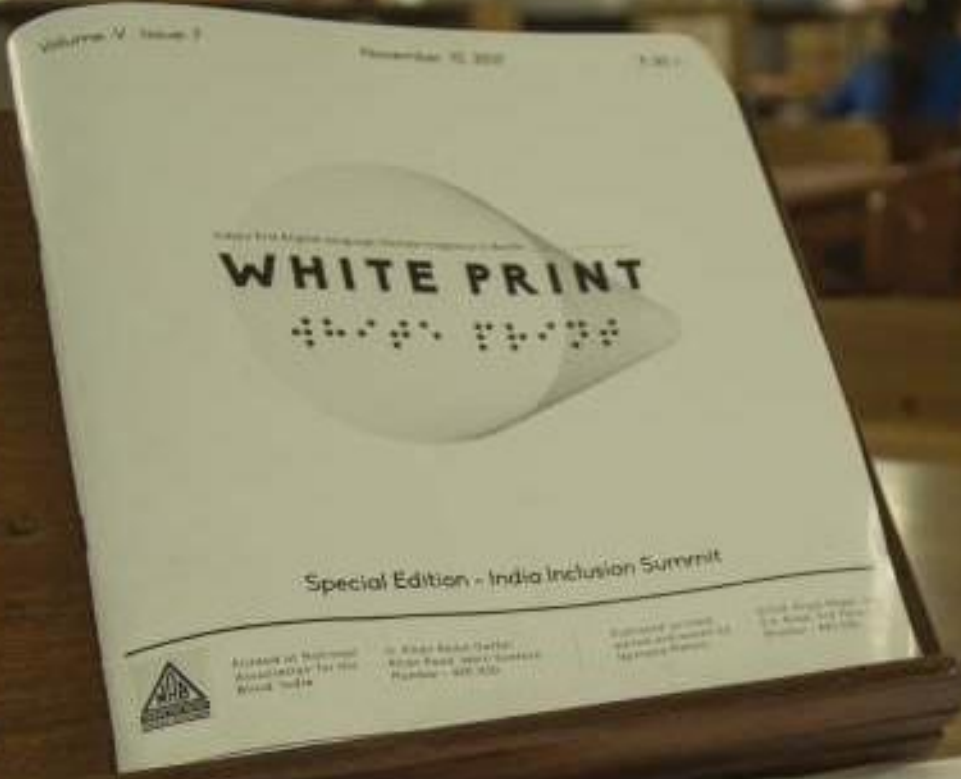
Braille Magazine—White Print