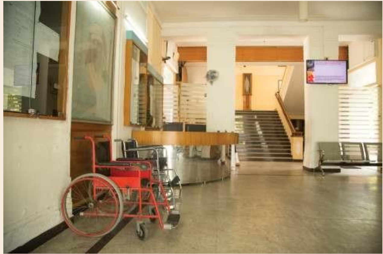
Elevator Facility and Wheelchairs for Special Students at Main Block