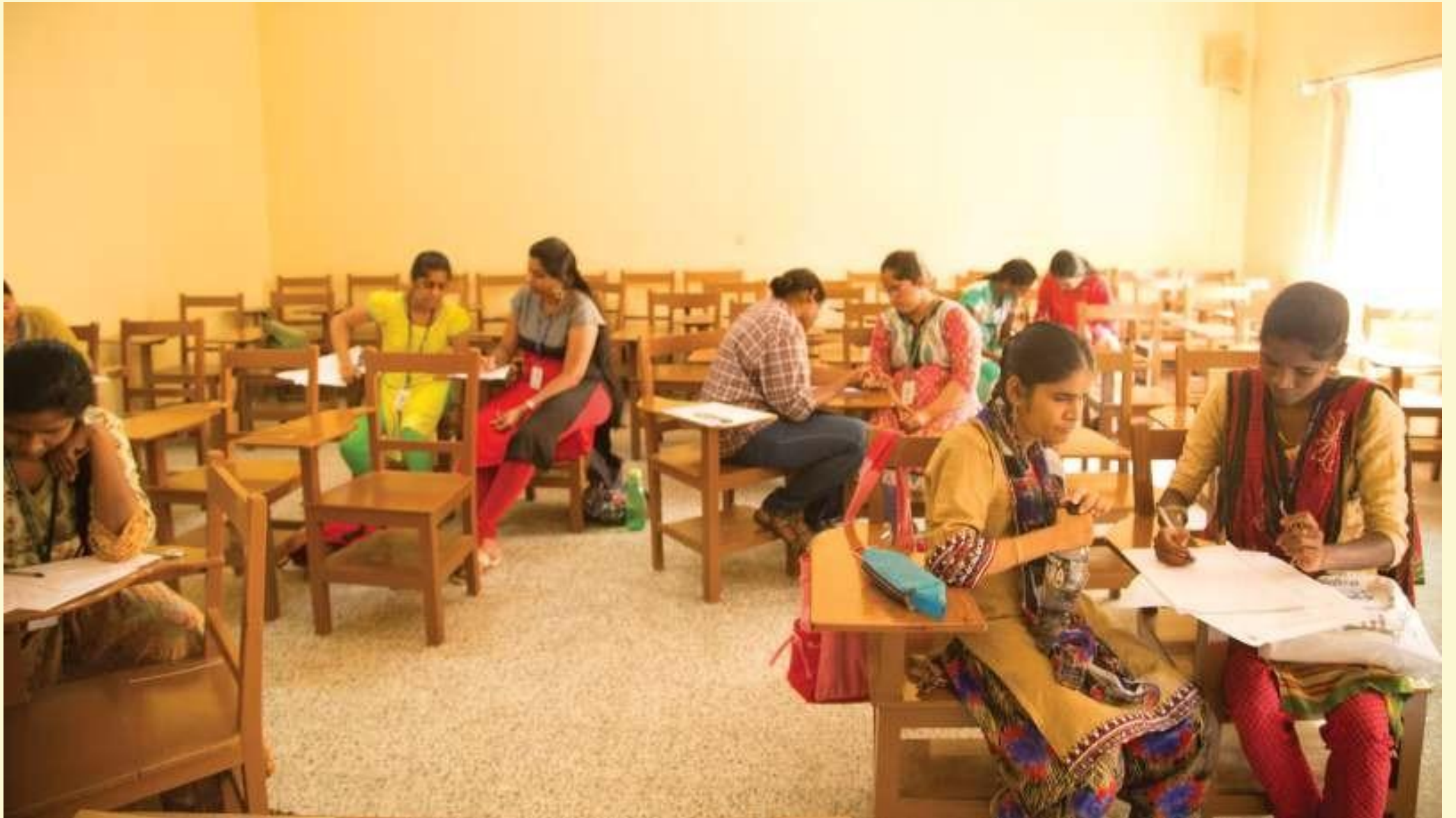
Scribing Services for Special Students